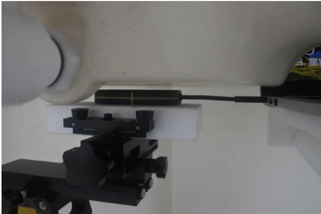
Front, Test Separation 5 mm