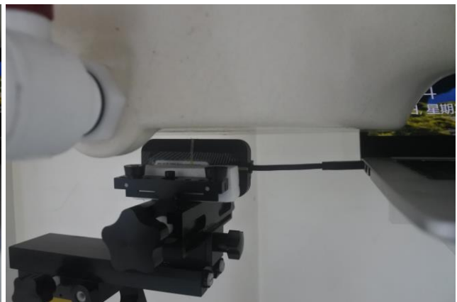
Right Side, Test Separation 5 mm