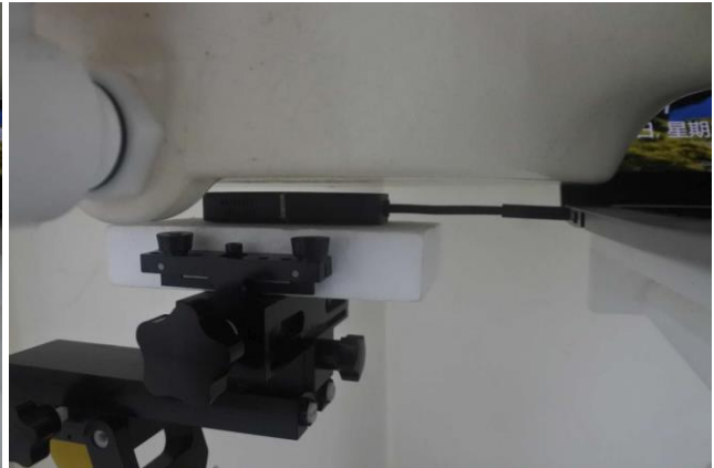
Back, Test Separation 5 mm