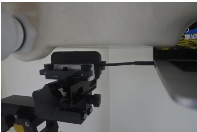
Left Side, Test Separation 5 mm