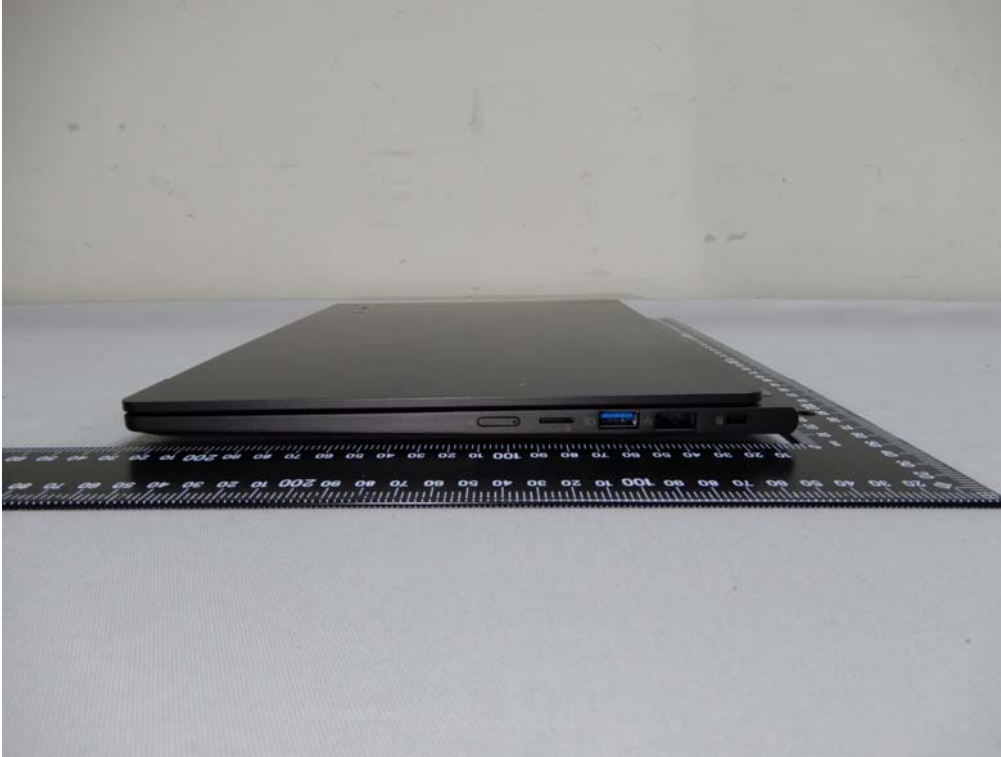
Adapter - 1