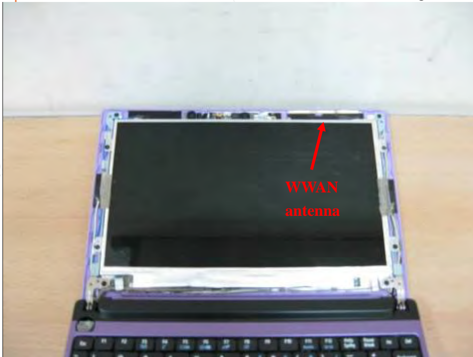
Fig.3 Antenna position of EUT