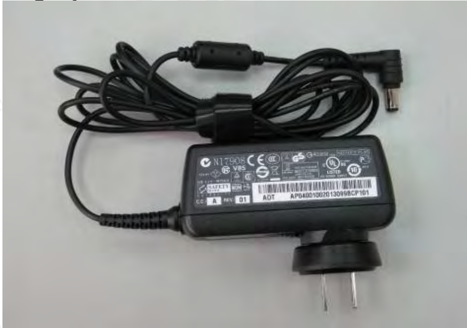
Fig.8 AC charger