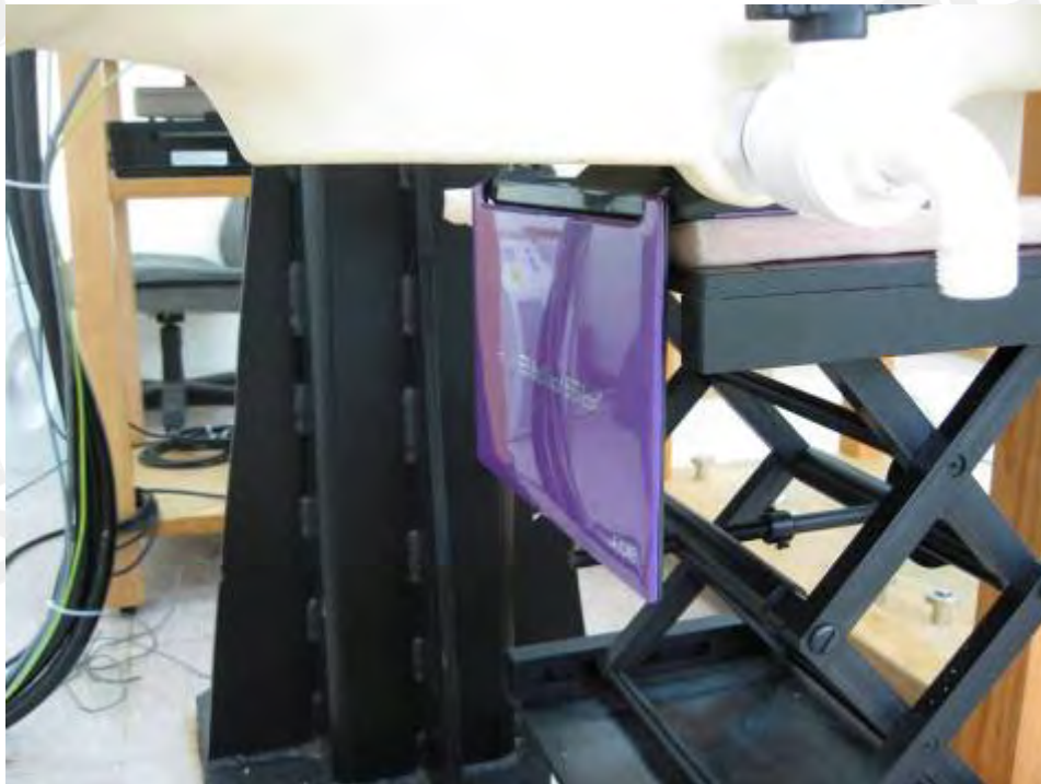
Fig.4 Lap-held mode

Unless otherwise stated the results shown in this test report refer only to the sample(s) tested and such sample(s) are retained for 90 days only. 除非另有說明，此報告結果僅對測試之樣品負責，同時此樣品僅保留90天。本報告未經本公司書面許可，不可部份複製。