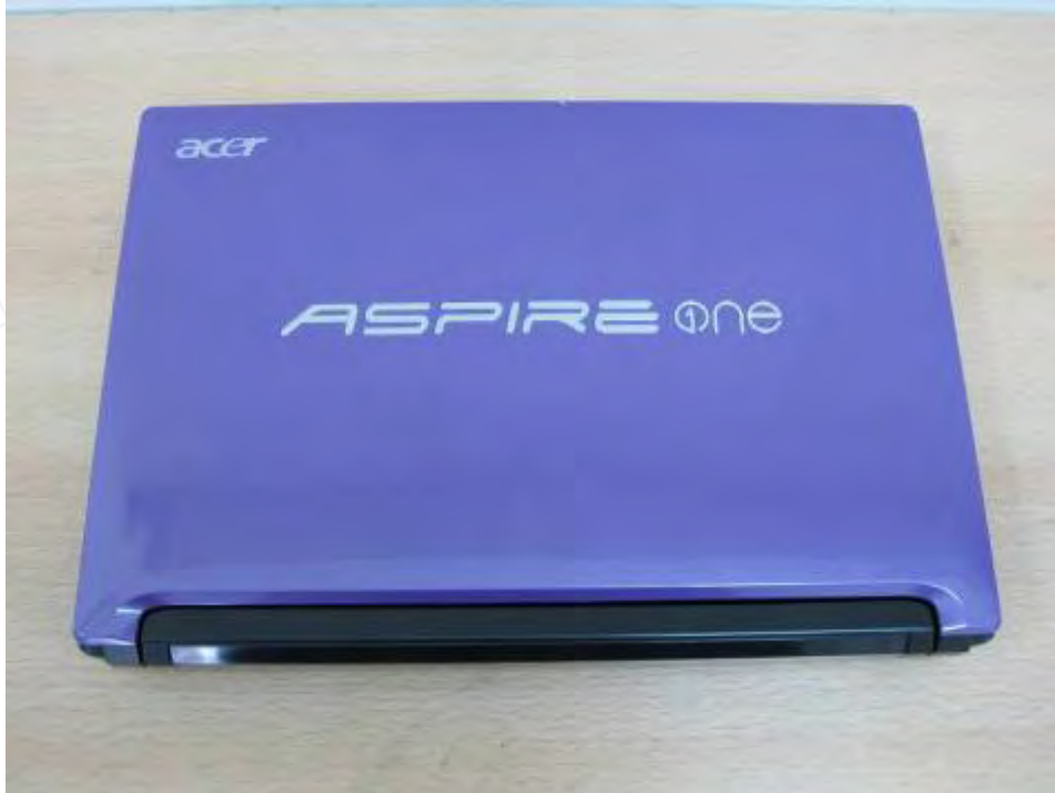
Fig.5 Front view of EUT