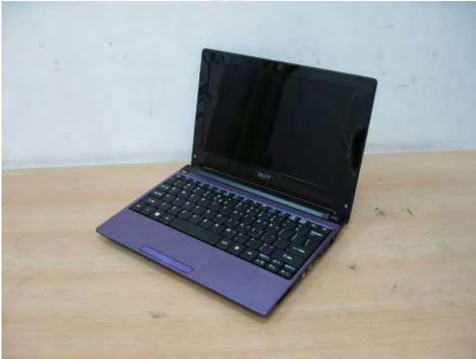
Fig.7 Fold up of EUT

Unless otherwise stated the results shown in this test report refer only to the sample(s) tested and such sample(s) are retained for 90 days only. 除非另有說明，此報告結果僅對測試之樣品負責，同時此樣品僅保留90天。本報告未經本公司書面許可，不可部份複製。