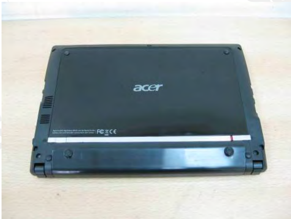
Fig.6 Back view of EUT

Unless otherwise stated the results shown in this test report refer only to the sample(s) tested and such sample(s) are retained for 90 days only. 除非另有說明，此報告結果僅對測試之樣品負責，同時此樣品僅保留90天。本報告未經本公司書面許可，不可部份複製。