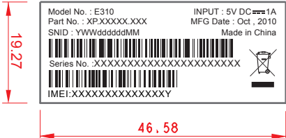
Printed by CCI (XX Material)