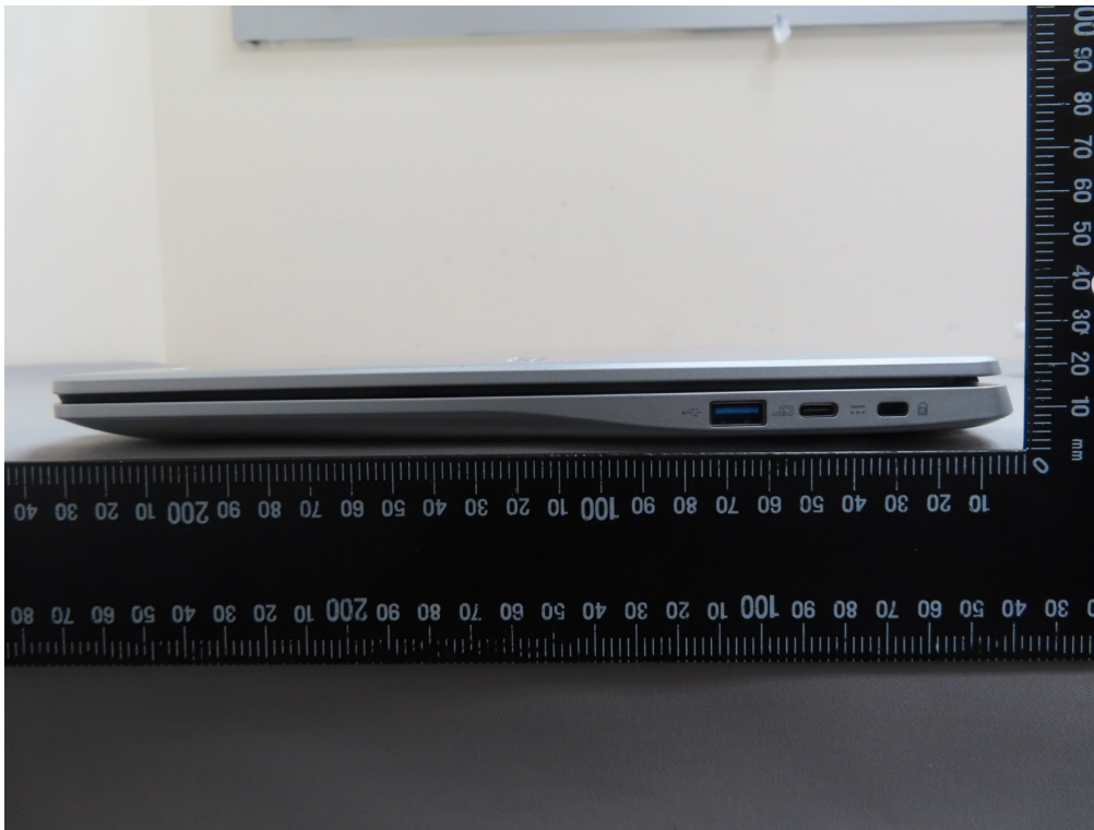
Adapter – 1