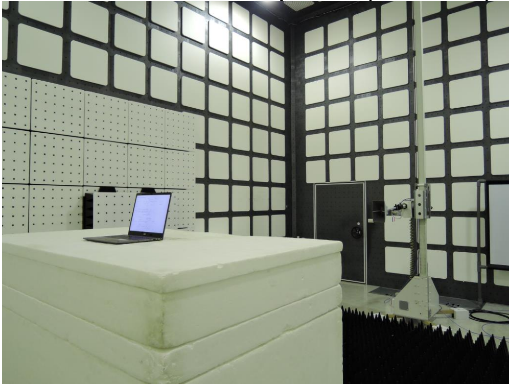
NB Radiated Emission Set up Photos (Front View)