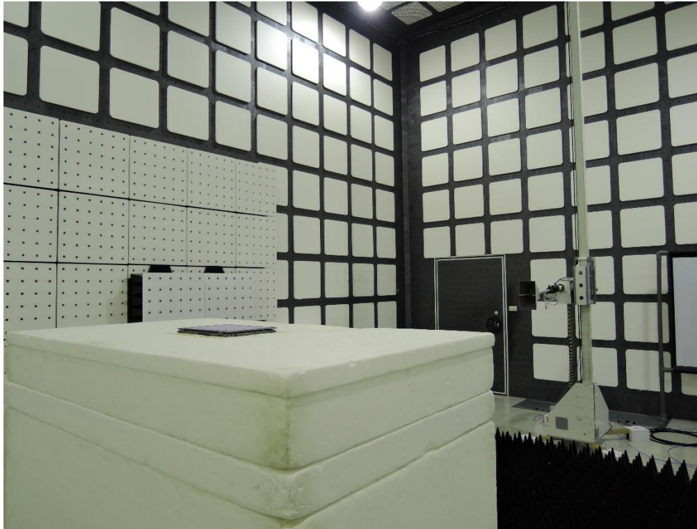
Radiated Emission Set up Photos (Front View)