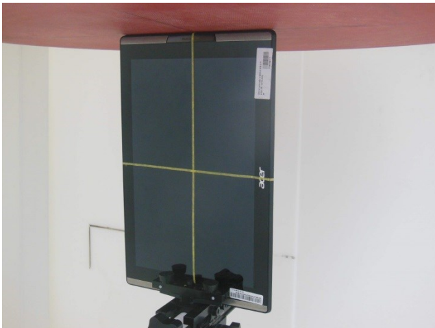
Edge4, Test Separation 0 mm