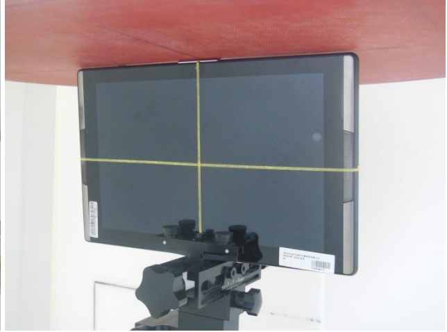
Edge1, Test Separation 0 mm