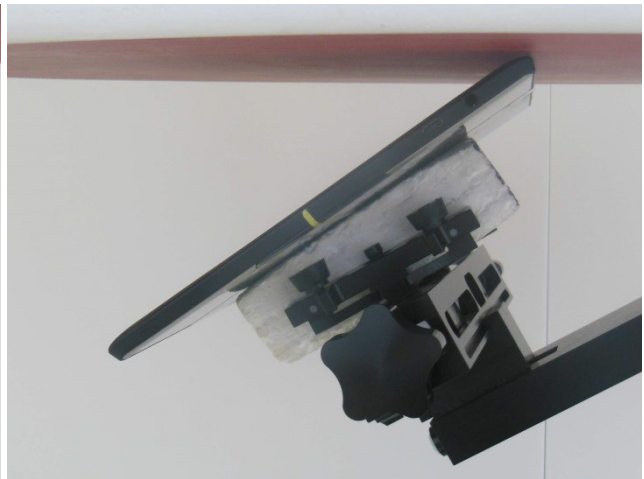
Curved surface of Edge1, Test Separation 0 mm