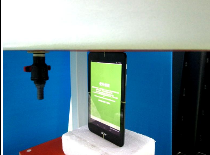
Top Side of EUT with 0 cm Gap