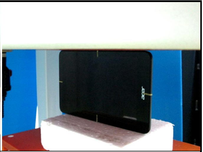
Right Side of EUT with 0 cm Gap