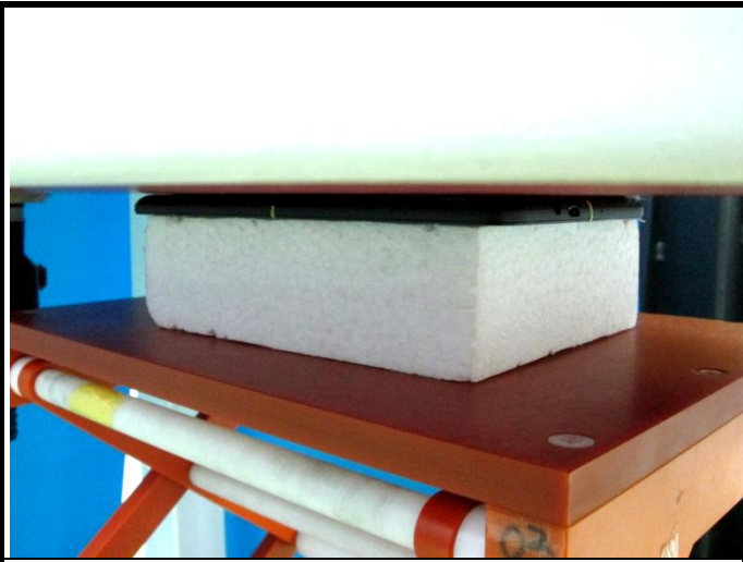
Rear Face of EUT with 0 cm Gap