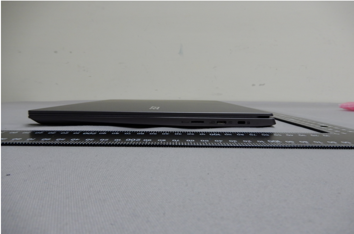
Side View of EUT – 3