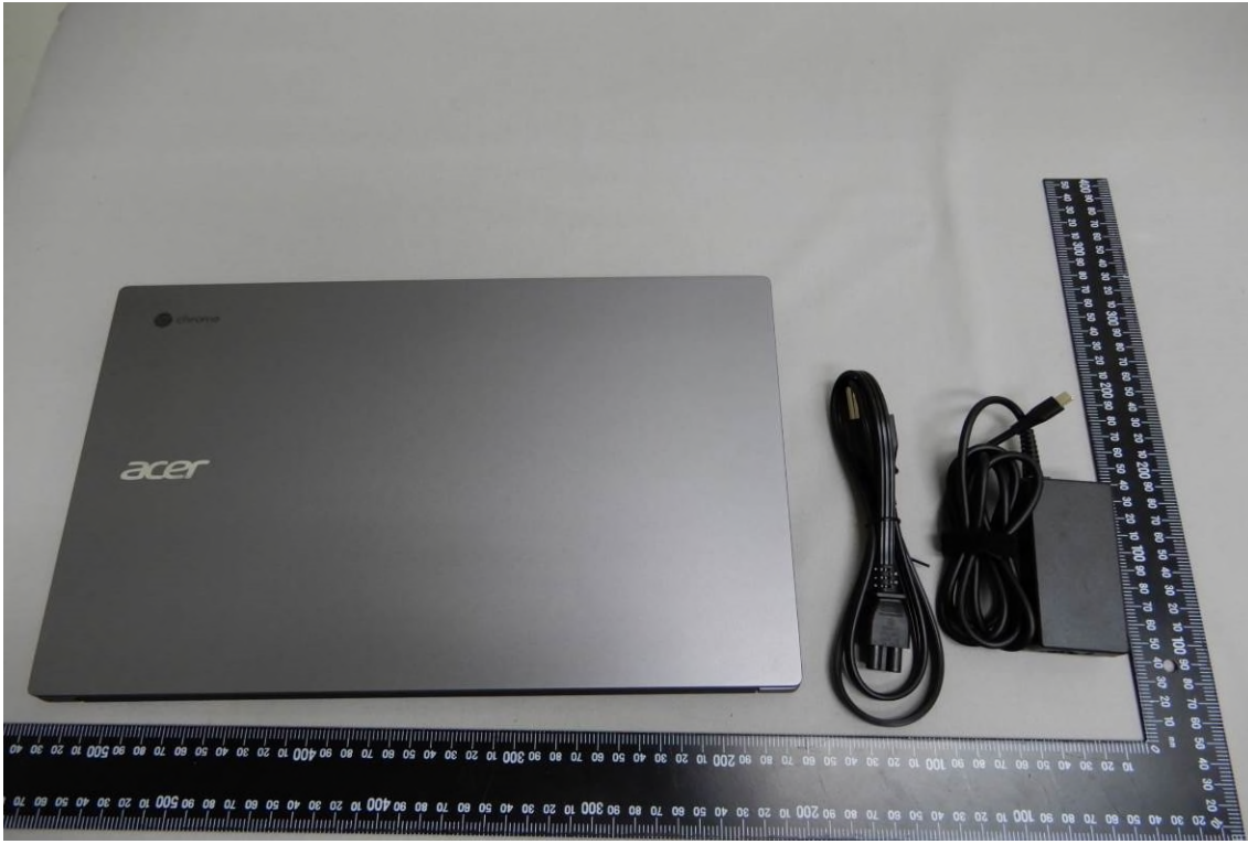
Front View of EUT-1