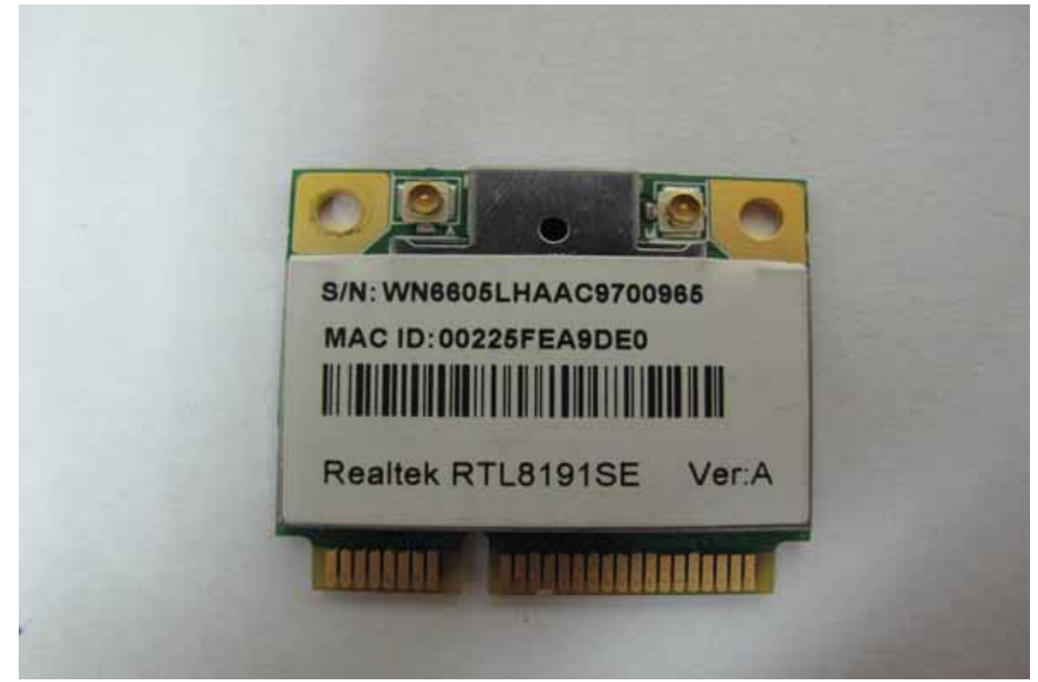
Internal of EUT – 2