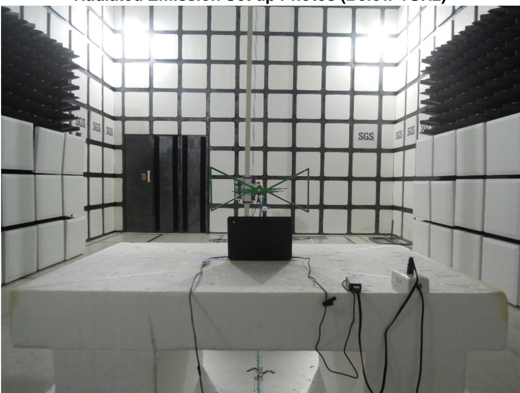
Radiated Emission Set up Photos (Above 1GHz)