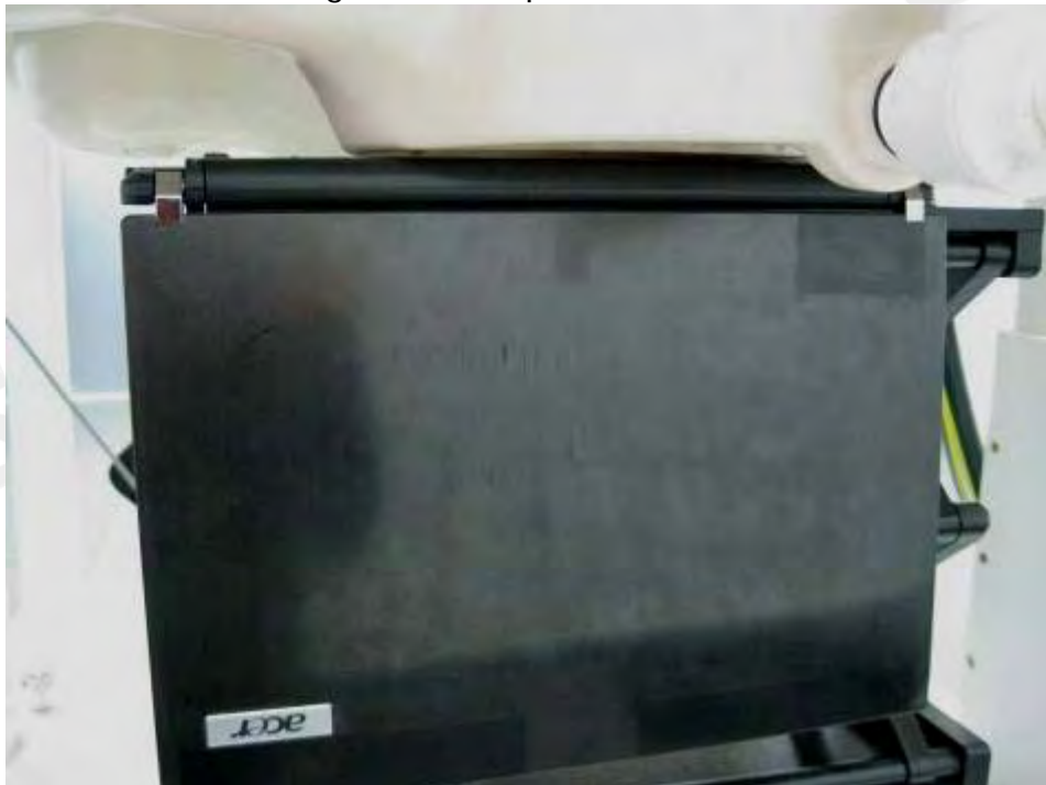
Fig.4 Laptop mode_ Main Antenna

Unless otherwise stated the results shown in this test report refer only to the sample(s) tested and such sample(s) are retained for 90 days only. 除非另有說明，此報告結果僅對測試之樣品負責，同時此樣品僅保留90天。本報告未經本公司書面許可，不可部份複製。