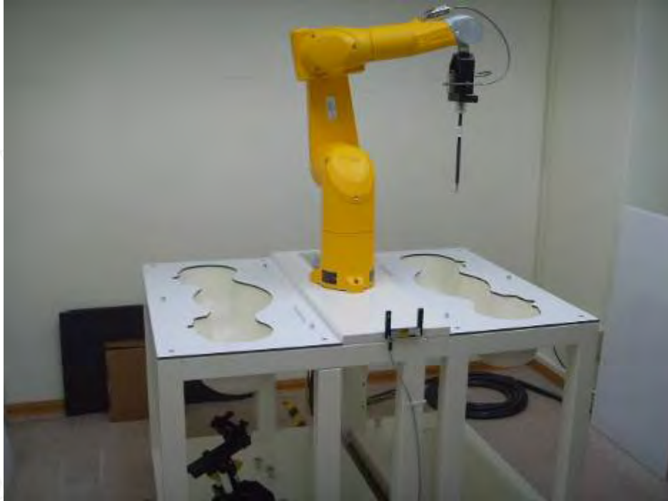
Fig.1 Photograph of the SAR measurement System