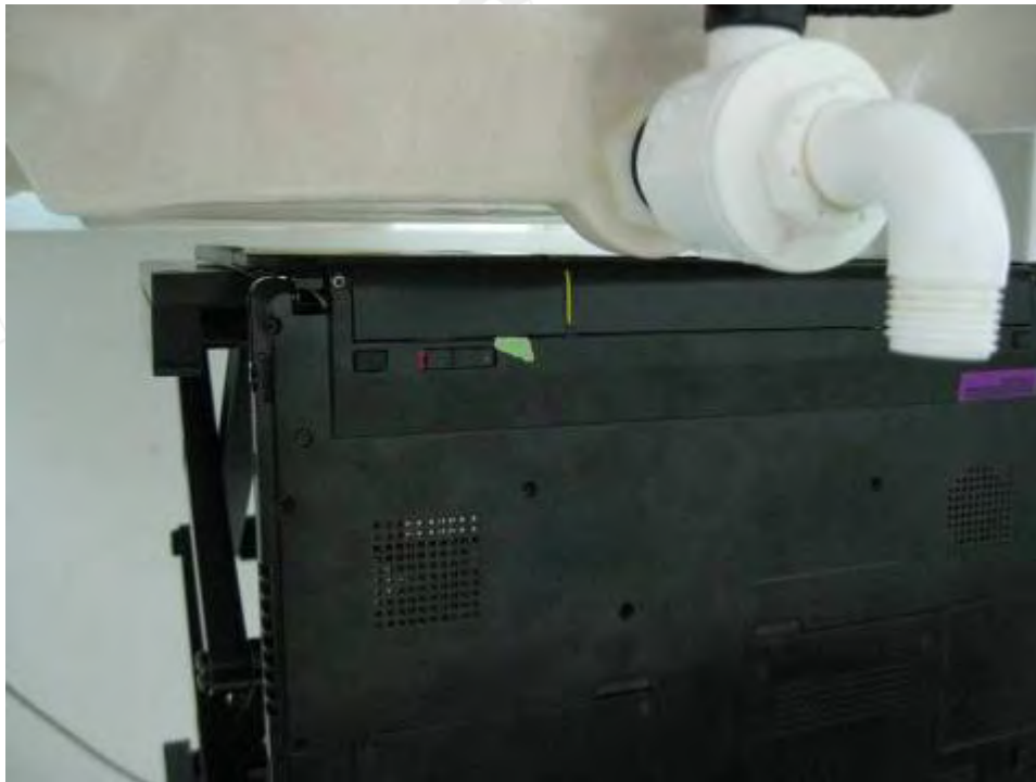
Fig.5 RSS102 mode_ Main Antenna