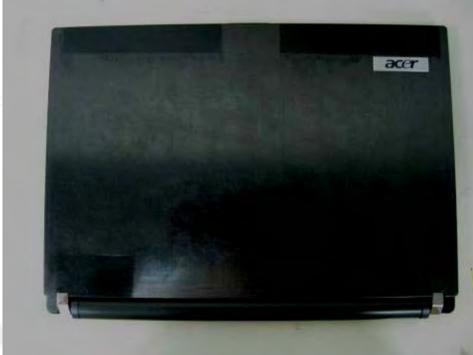
Fig.7 Front view of EUT