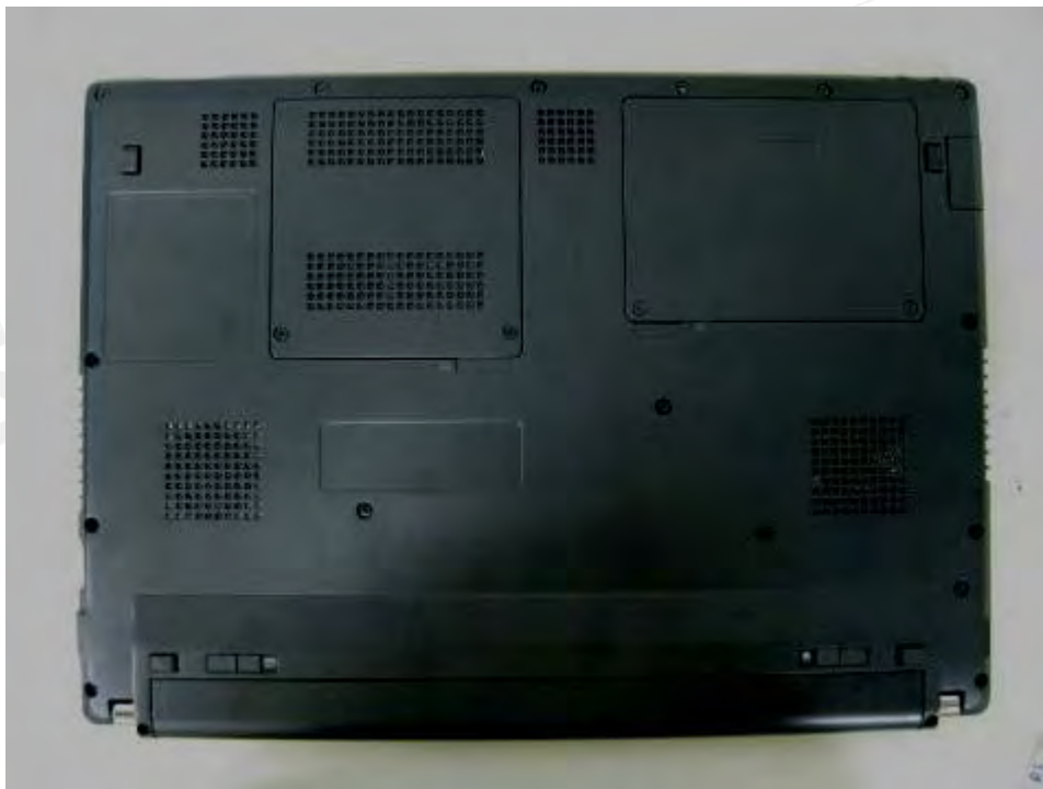
Fig.8 Back view of EUT

Unless otherwise stated the results shown in this test report refer only to the sample(s) tested and such sample(s) are retained for 90 days only. 除非另有說明，此報告結果僅對測試之樣品負責，同時此樣品僅保留90天。本報告未經本公司書面許可，不可部份複製。