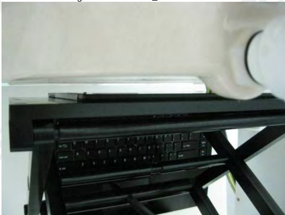
Fig.6 RSS102 mode_ AUX Antenna

Unless otherwise stated the results shown in this test report refer only to the sample(s) tested and such sample(s) are retained for 90 days only. 除非另有說明，此報告結果僅對測試之樣品負責，同時此樣品僅保留90天。本報告未經本公司書面許可，不可部份複製。