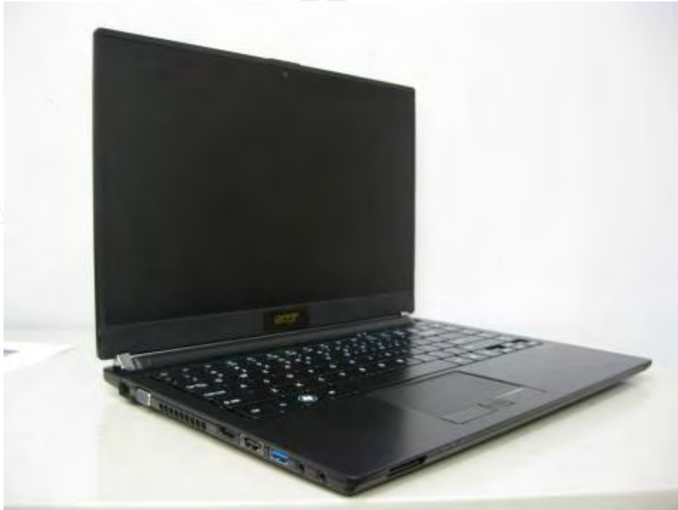
Fig.9 Fold up of EUT

Unless otherwise stated the results shown in this test report refer only to the sample(s) tested and such sample(s) are retained for 90 days only. 除非另有說明，此報告結果僅對測試之樣品負責，同時此樣品僅保留90天。本報告未經本公司書面許可，不可部份複製。