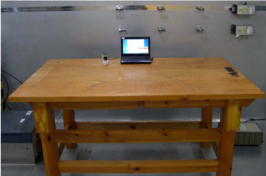
The Front View of Highest Conducted Set-up For EUT