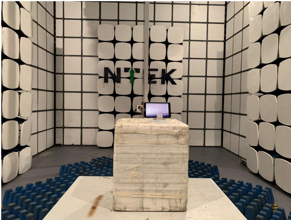
AC Conducted Measurement Photos