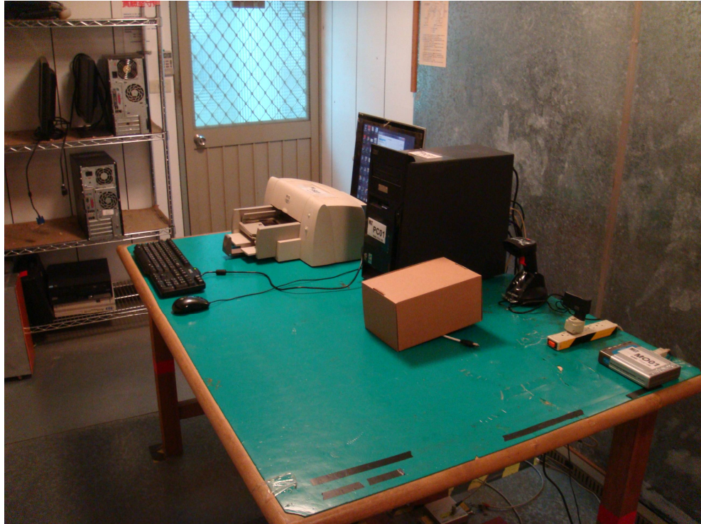
< CE Rear View >