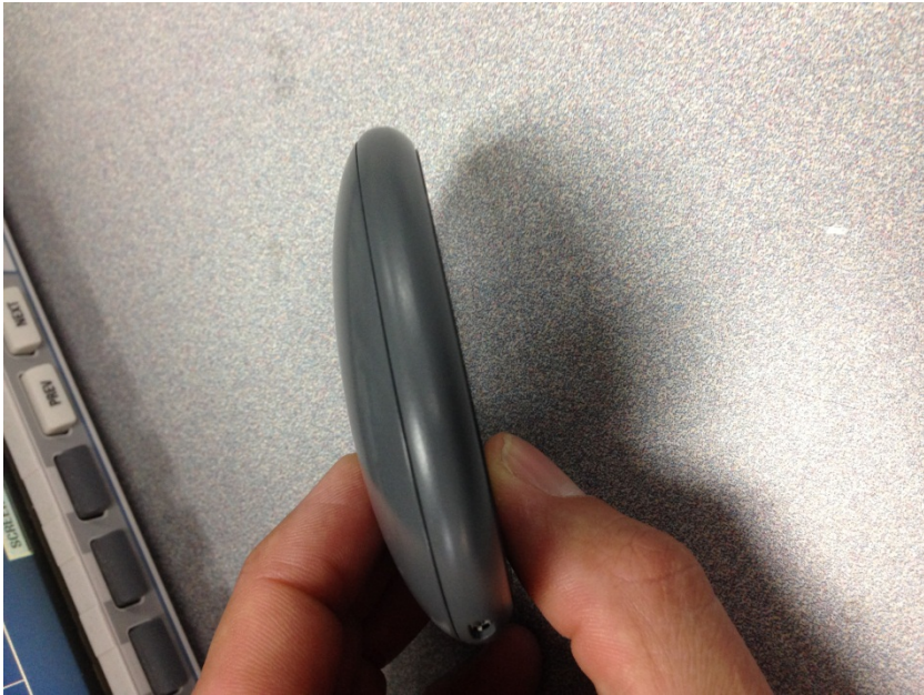
Side view #1