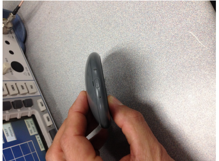
Side view #2