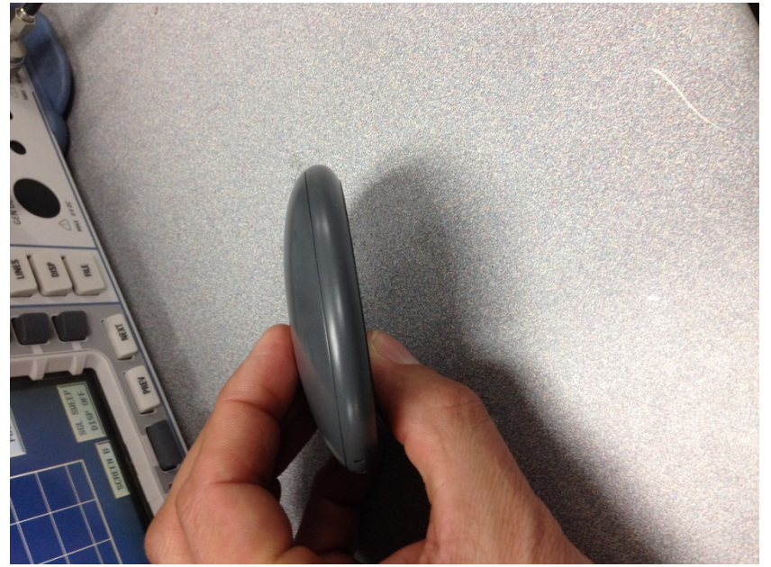
Side view #4