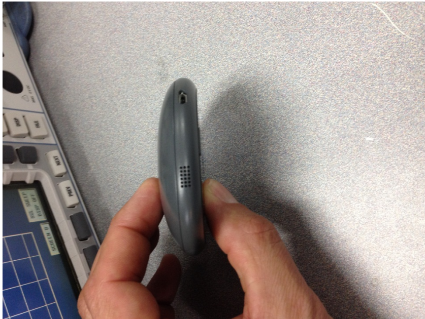
Side view #3