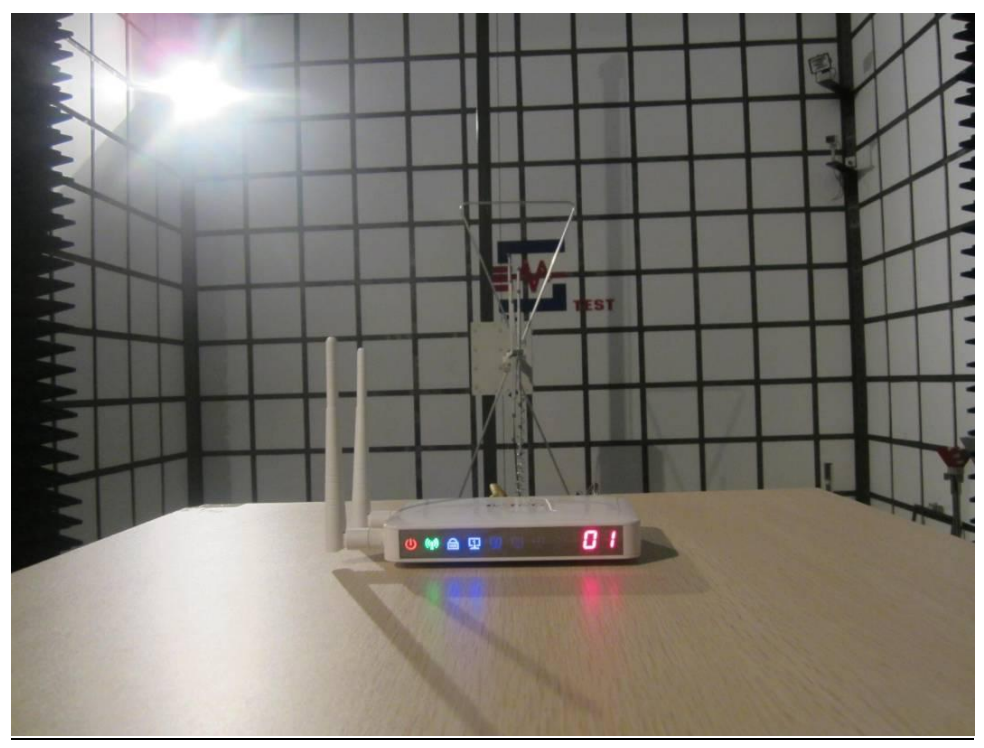
Page 1 of 2 TÜV SÜD China. 6th Floor, H Hall, Century Craftwork Culture Square, No. 4001,Fuqiang Road, Futian District, Shenzhen, China.