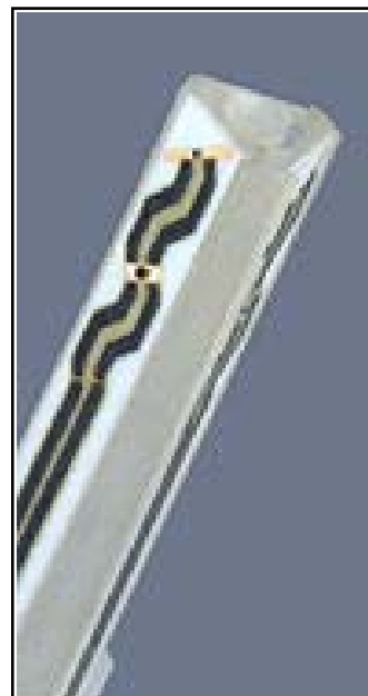
Inside View of ET3DV6 E-field Probe