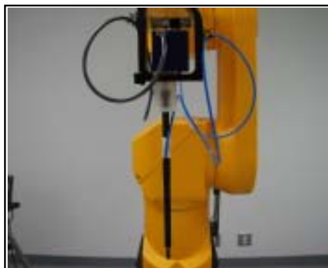
Photograph of the Probe

The SAR measurements were conducted with the dosimetric probe ET3DV6 designed in the classical triangular configuration and optimized for dosimetric evaluation. The probe is constructed using the thick film technique, with printed resistive lines on ceramic substrates. The probe is equipped with an optical multi-fiber line ending at the front of the probe tip. It is connected to the EOC box on the robot arm and provides an automatic detection of the phantom surface. Half of the fibers are connected to a pulsed infrared transmitter, the other half to a synchronized receiver. As the probe approaches the surface, the reflection from the surface produces a coupling from the transmitting to the receiving fibers. This reflection increases first during the approach, reaches maximum and then decreases. If the probe is flatly touching the surface, the coupling is zero. The distance of the coupling maximum to the surface is independent of the surface reflectivity and largely independent of the surface to probe angle. The DASY4 software reads the reflection during a software approach and looks for the maximum using a 2nd order fitting. The approach is stopped when reaching the maximum.