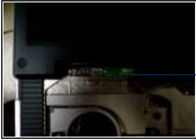
Antenna 1(Main port)