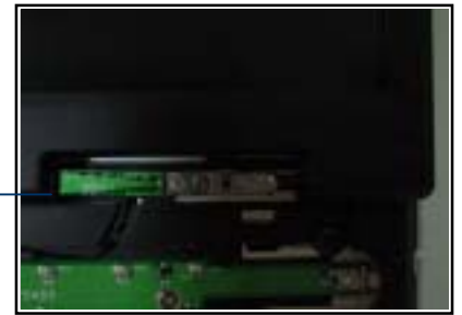
Antenna 2(Aux port)