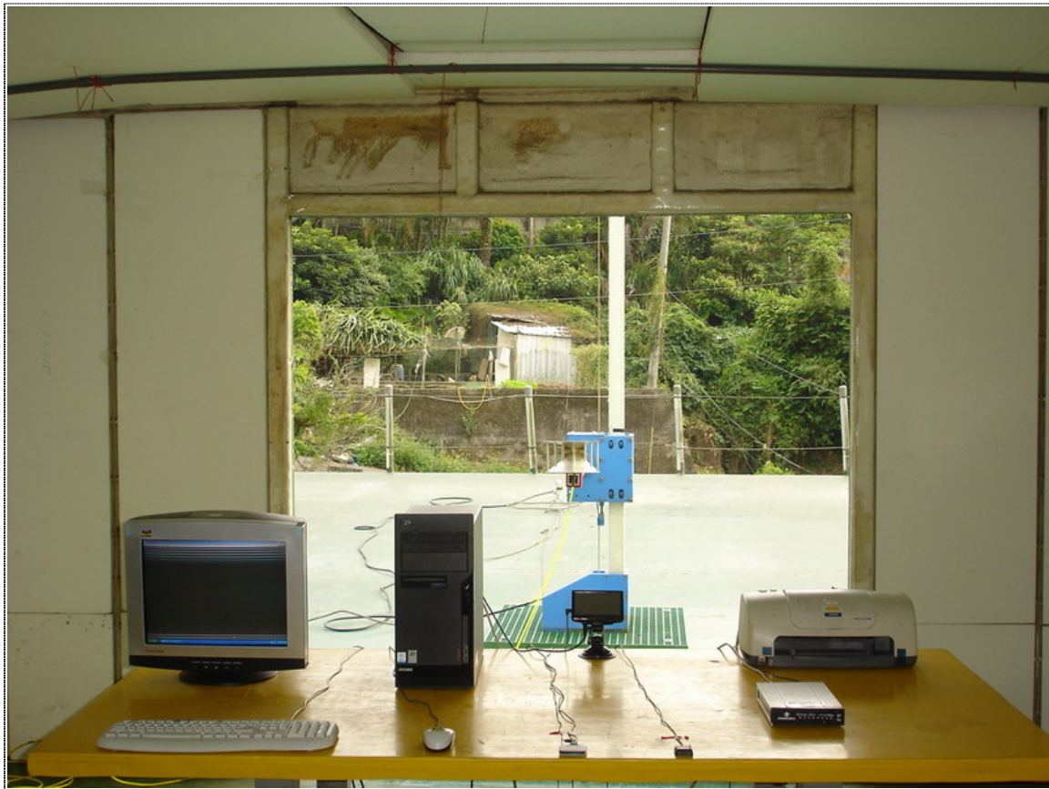
Front View (Frequency 1-18GHz)