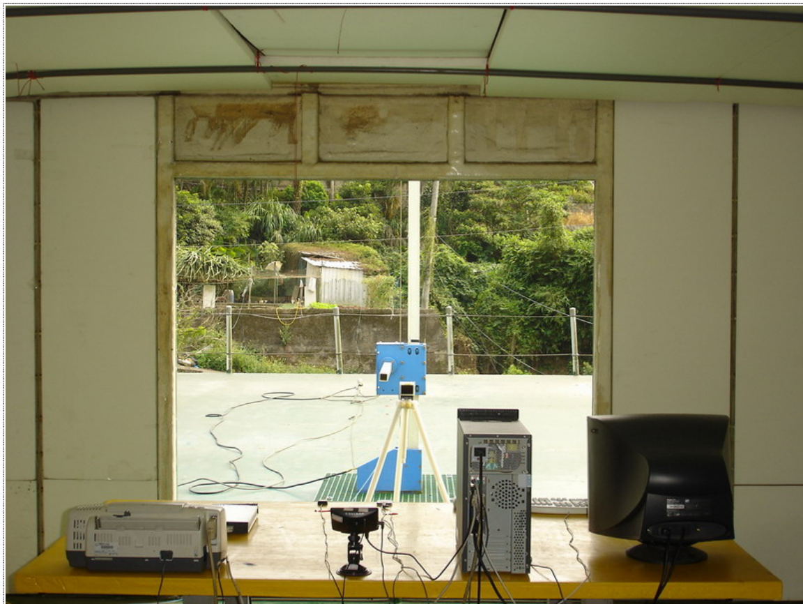
Rear View (Frequency above 18GHz)