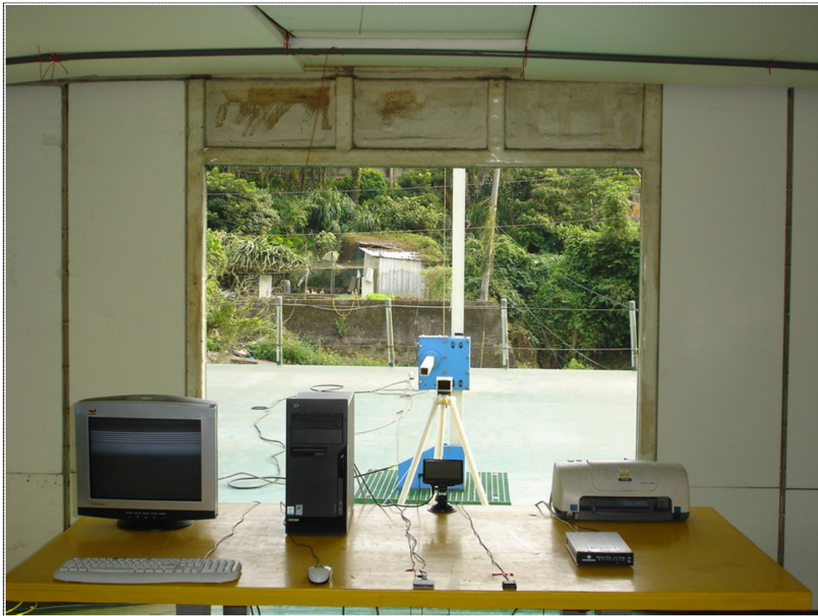
Front View (Frequency above 18GHz)