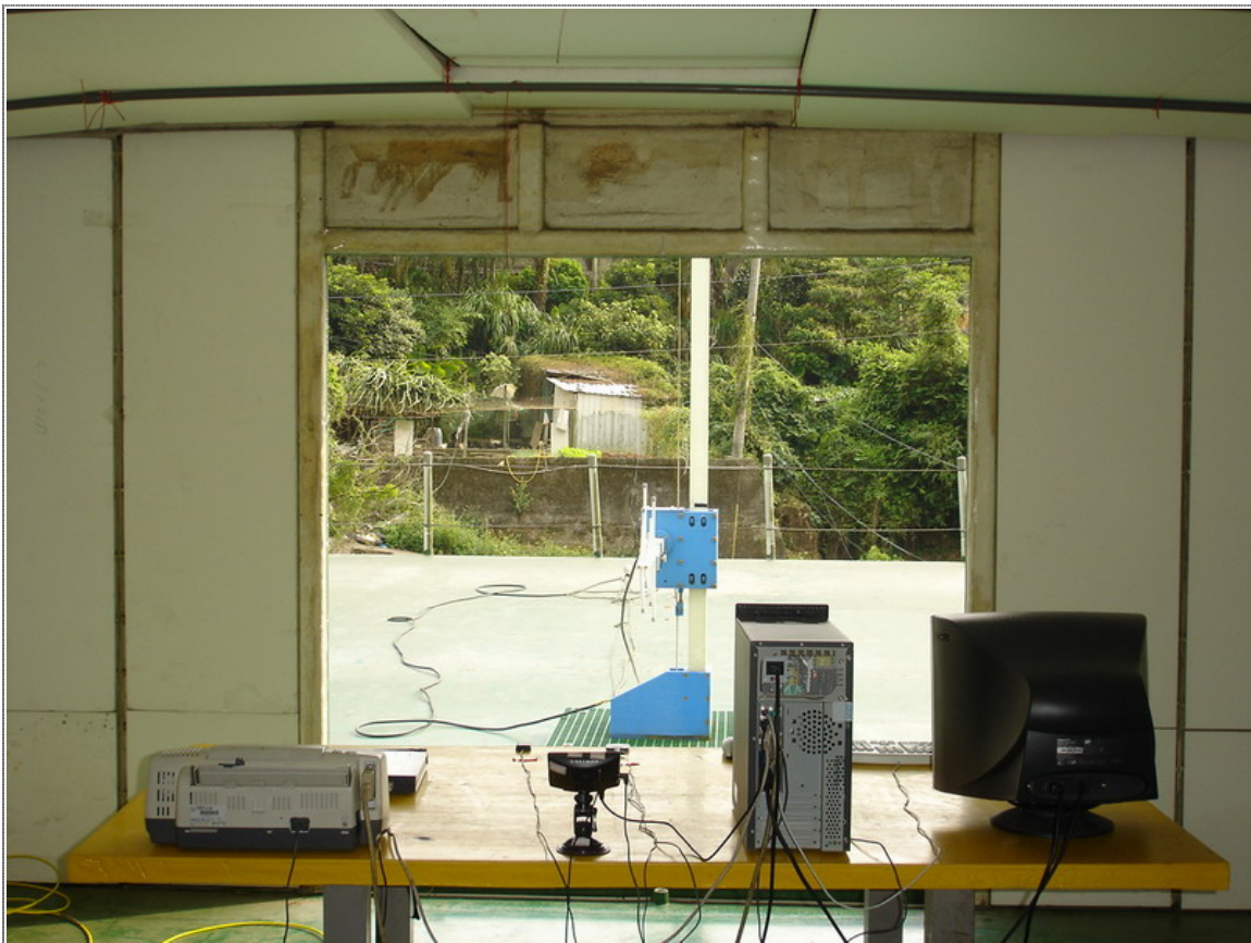
Rear View (Frequency under 1GHz)