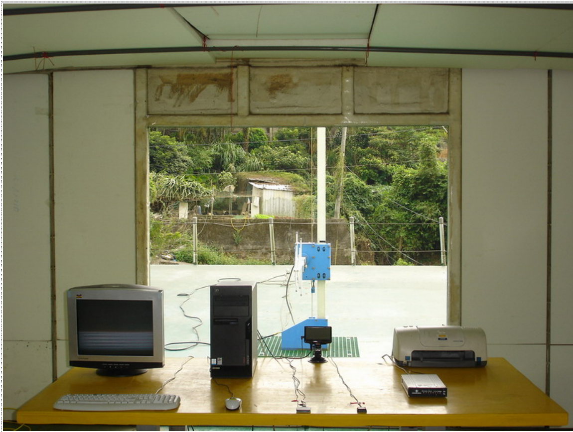
Front View (Frequency under 1GHz)