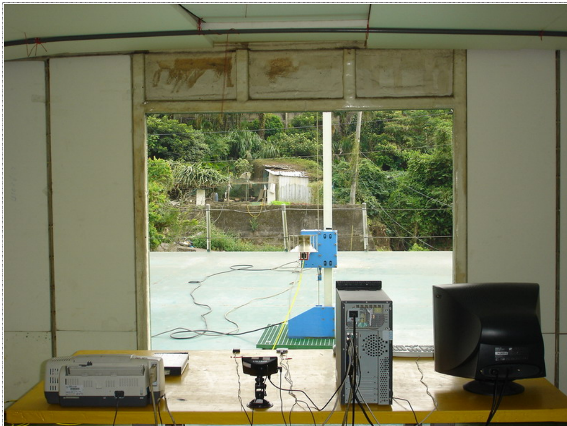
Rear View (Frequency 1-18GHz)