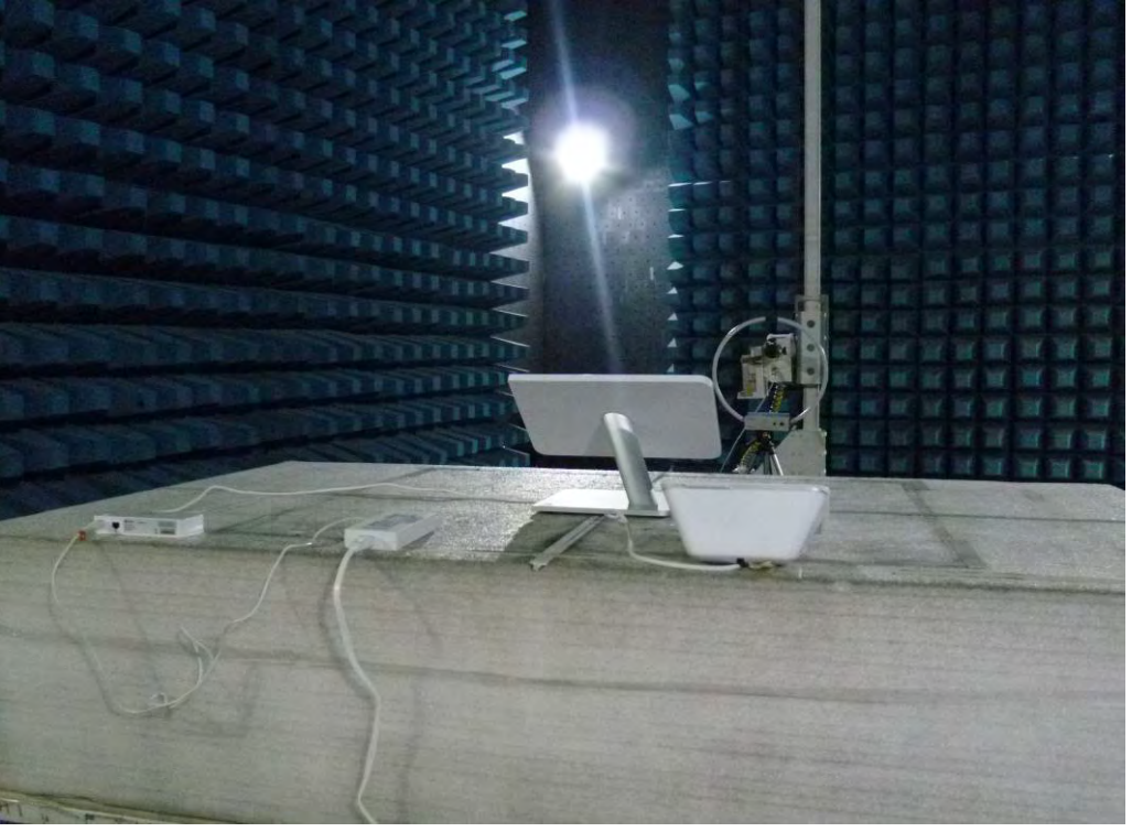
Radiated Emission Setup Photos (30MHz~1GHz)