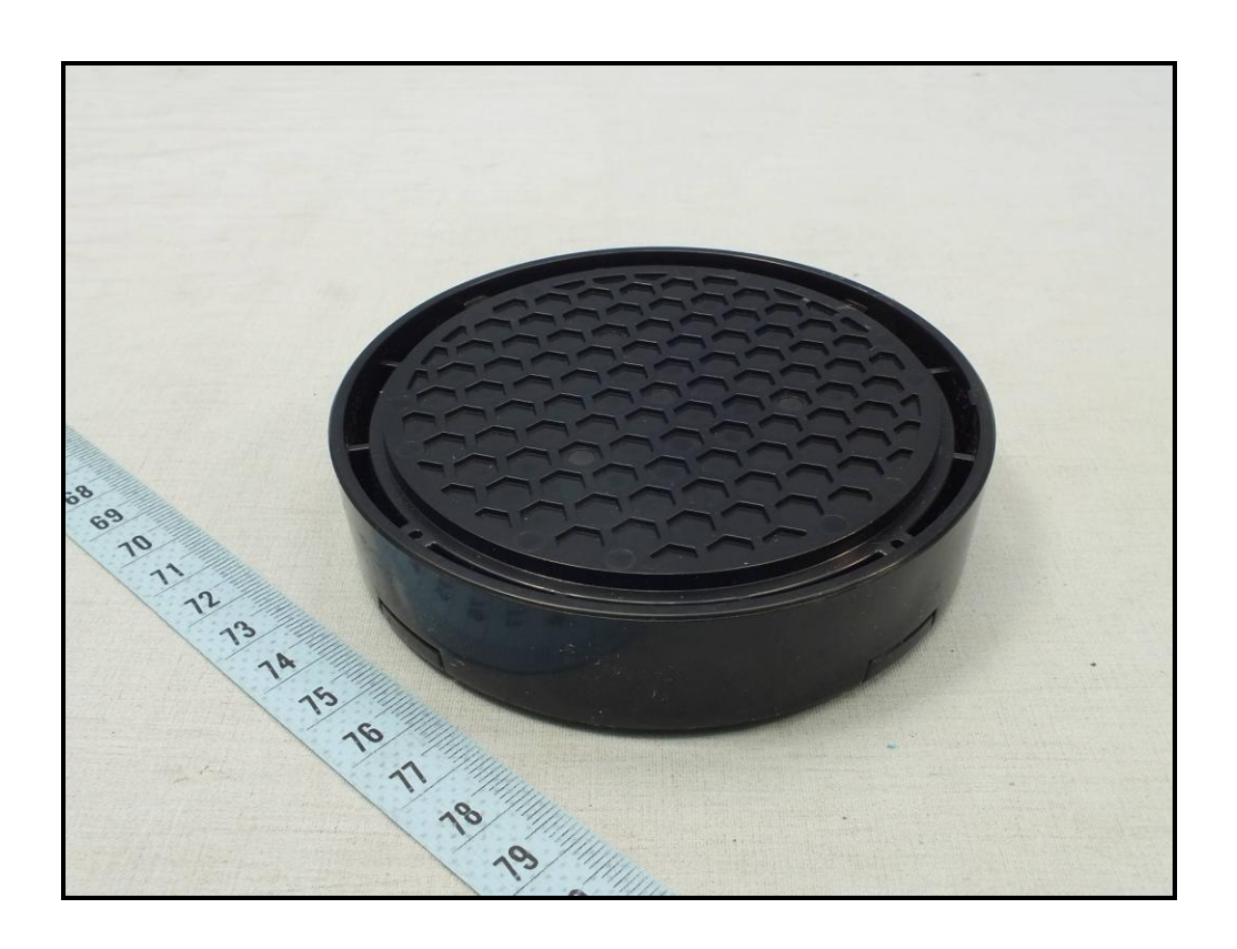
Page 1 of 6