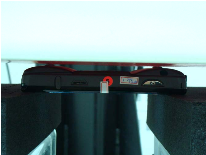
Rear Face with 0cm Gap