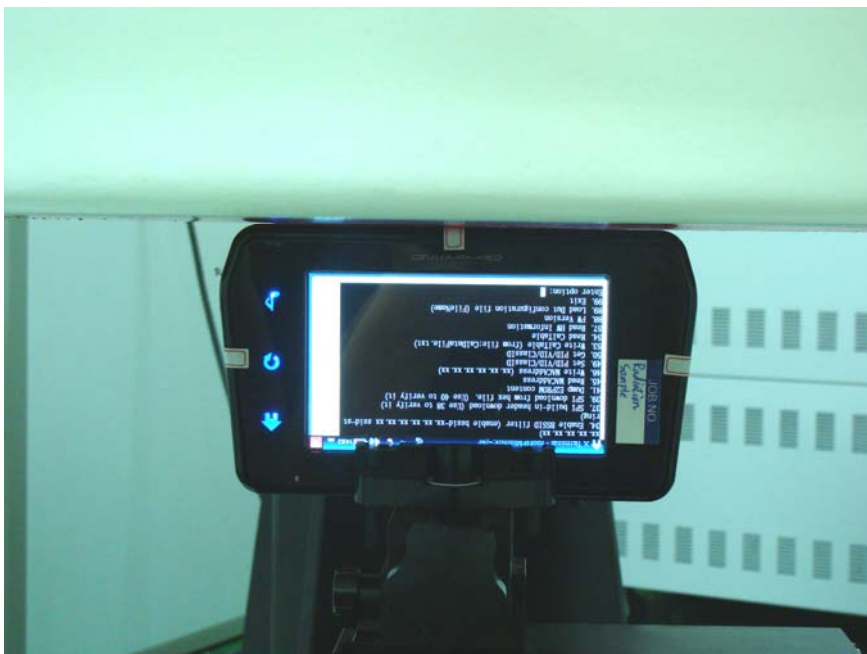
Bottom Side with 0cm Gap