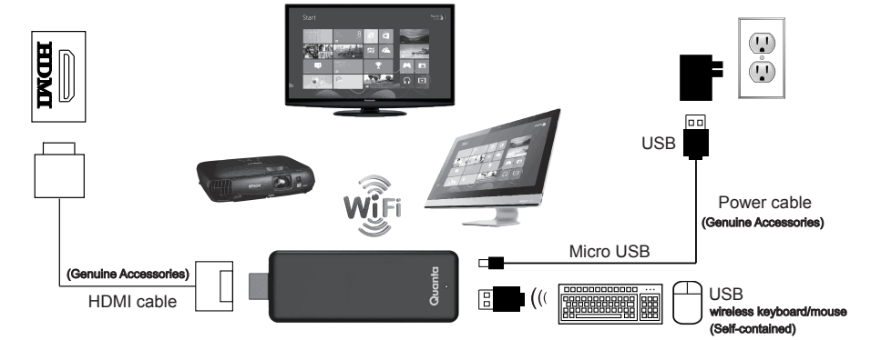
Support Bluetooth keyboards/mouse