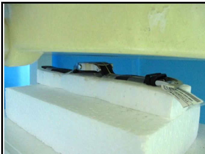
Front Face of EUT with 1 cm Gap