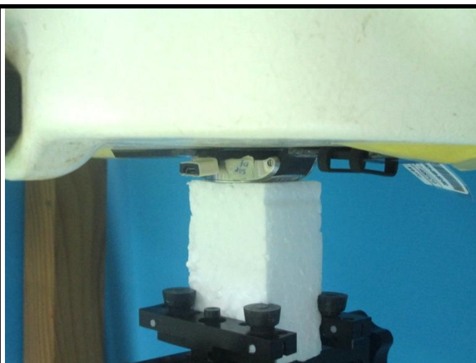
Rear Face of EUT with 0 cm Gap