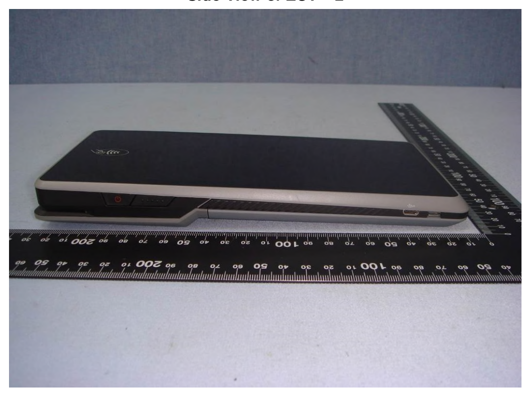
Side View of EUT - 3