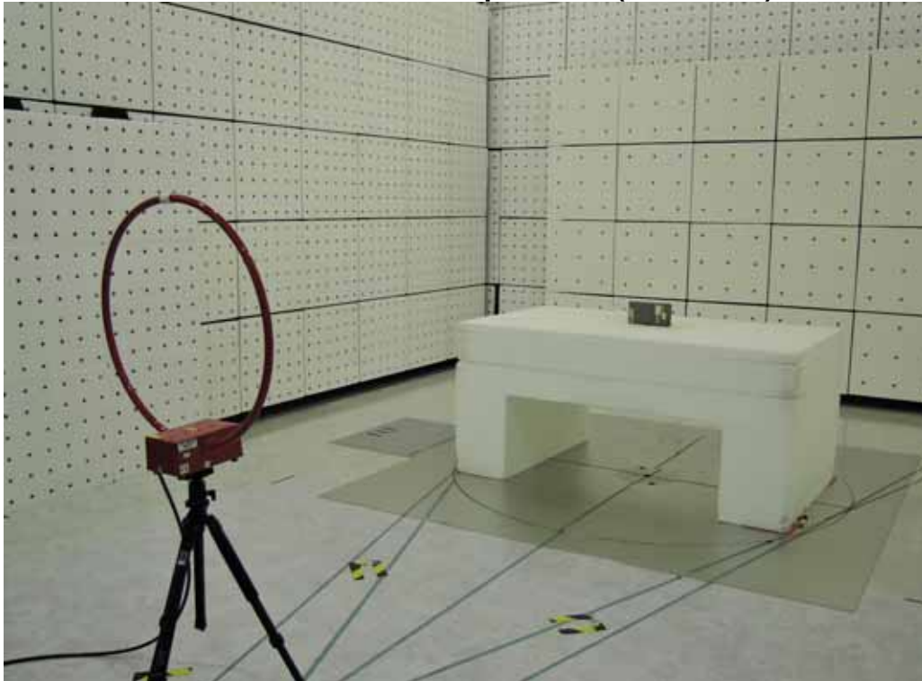
Radiated Emission Setup Photos (30MHz~1GHz)