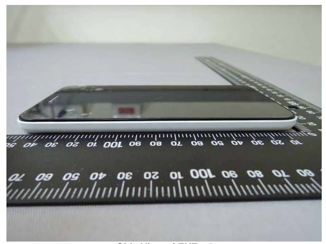
Side View of EUT - 3