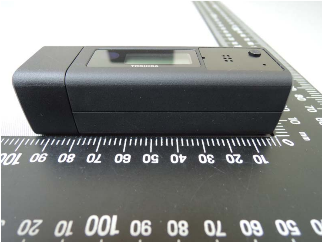
Side View of EUT - 2