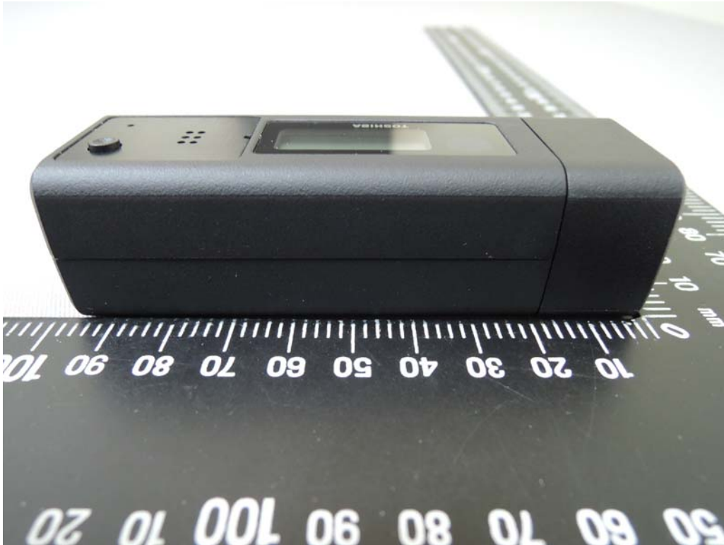
Side View of EUT – 4