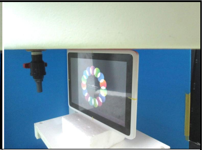
Top Side of EUT with 0 cm Gap