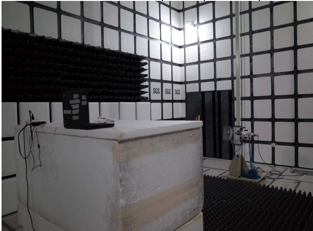
Radiated Emission Set up Photos (Front View)