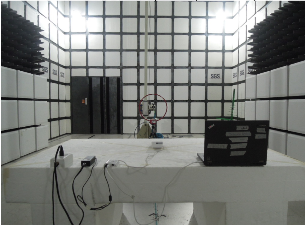
Radiated Emission Set up Photos (Below 1GHz)