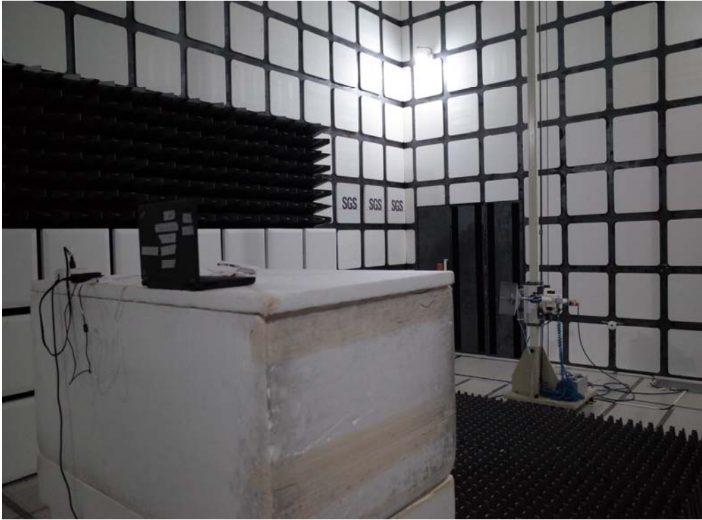
Radiated Emission Set up Photos (Front View)