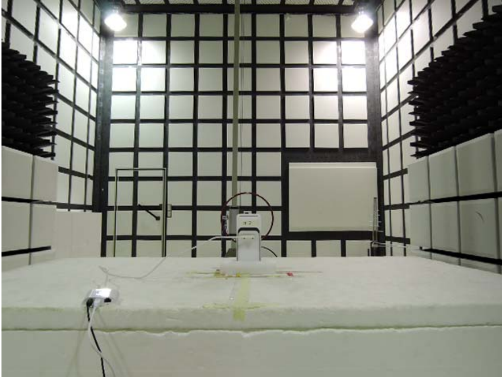
Radiated Emission Set up Photos (Below 1GHz)