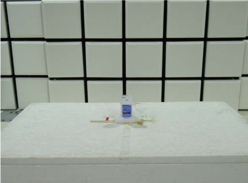
Front View of test setup

Unless otherwise stated the results shown in this test report refer only to the sample(s) tested and such sample(s) are retained for 90 days only.