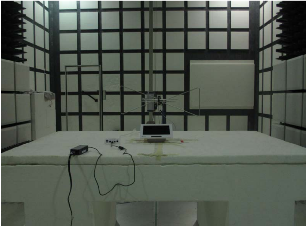
Conducted Setup Photo (Measurement at Antenna Port)