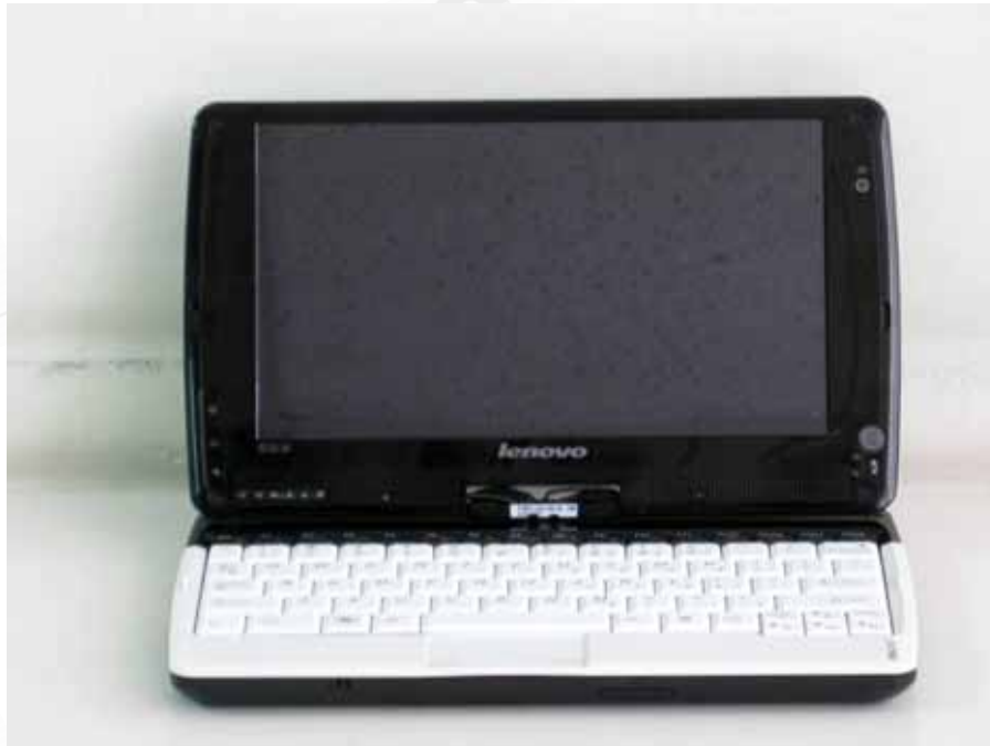
Fig.11 Fold up of EUT

Unless otherwise stated the results shown in this test report refer only to the sample(s) tested and such sample(s) are retained for 90 days only. This test report cannot be reproduced, except in full, without prior written permission of the Company. 除非另有說明，此報告結果僅對測試之樣品負責，同時此樣品僅保留90天。本報告未經本公司書面許可，不可部份複製。 This document is issued by the Company subject to its General Conditions of Service ( www.sgs.com/terms_and_conditions.htm ) and Terms and Conditions for Electronic Documents ( www.sgs.com/terms_e-document.htm ). Attention is drawn to the limitations of liability, indemnification and jurisdictional issues established therein. Even if printed this electronic document is to be treated as an original within the meaning of UCP 600 article 20b. The authenticity of this document may be verified at www.sgsonsite.com/authentication . Any holder of this document is advised that information contained hereon reflects the Company's findings at the time of its intervention only and within the limits of client's instructions, if any. The Company's sole responsibility is to its Client and this document does not exonerate parties to a transaction from exercising all their rights and obligations under the transaction documents.