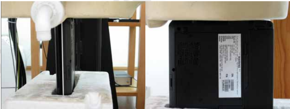
Fig.6 Primary portrait mode