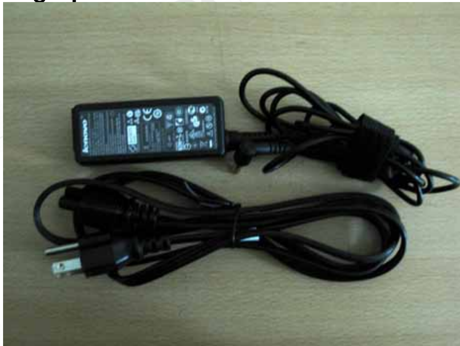
Fig.12 Notebook charger