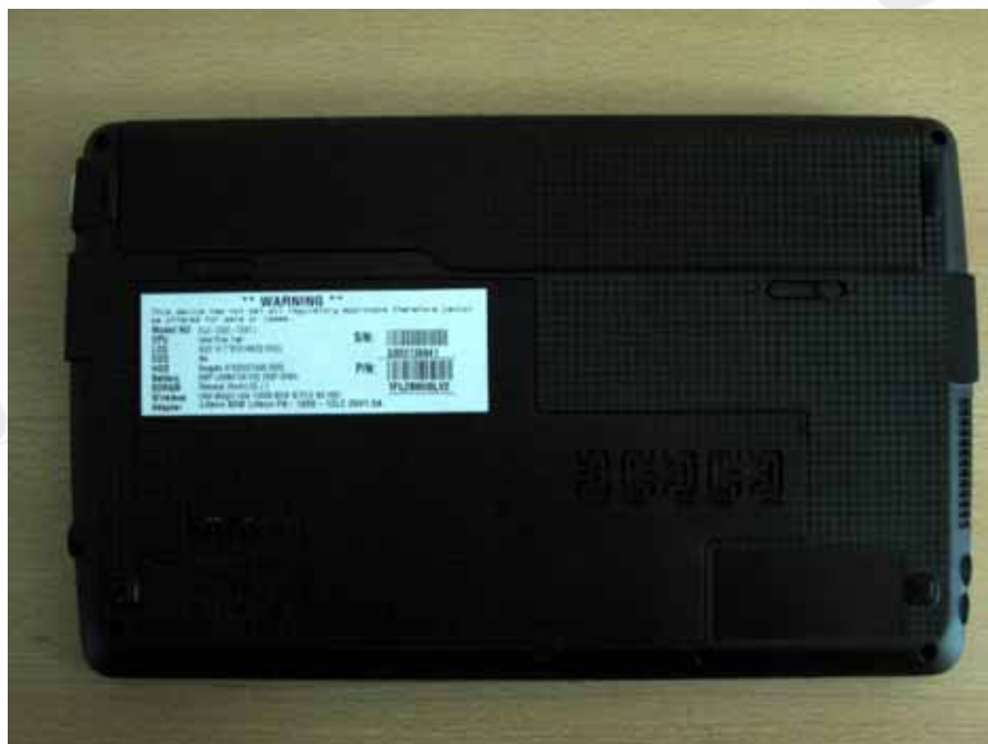
Fig.8 Back view of EUT

Unless otherwise stated the results shown in this test report refer only to the sample(s) tested and such sample(s) are retained for 90 days only. This test report cannot be reproduced, except in full, without prior written permission of the Company. 除非另有說明，此報告結果僅對測試之樣品負責，同時此樣品僅保留90天。本報告未經本公司書面許可，不可部份複製。 This document is issued by the Company subject to its General Conditions of Service ( www.sgs.com/terms_and_conditions.htm ) and Terms and Conditions for Electronic Documents ( www.sgs.com/terms_e-document.htm ). Attention is drawn to the limitations of liability, indemnification and jurisdictional issues established therein. Even if printed this electronic document is to be treated as an original within the meaning of UCP 600 article 20b. The authenticity of this document may be verified at www.sgsonsite.com/authentication . Any holder of this document is advised that information contained hereon reflects the Company's findings at the time of its intervention only and within the limits of client's instructions, if any. The Company's sole responsibility is to its Client and this document does not exonerate parties to a transaction from exercising all their rights and obligations under the transaction documents.