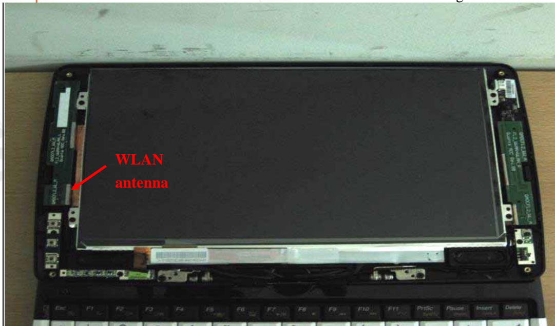
Fig.3 Antenna position of EUT