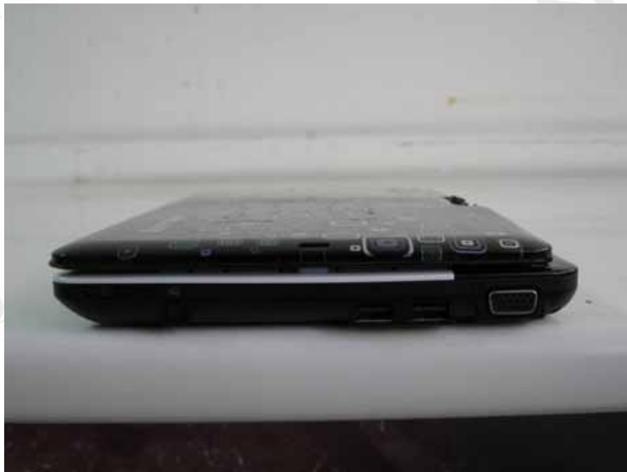
Fig.10 Right Side of EUT

Unless otherwise stated the results shown in this test report refer only to the sample(s) tested and such sample(s) are retained for 90 days only. This test report cannot be reproduced, except in full, without prior written permission of the Company. 除非另有說明，此報告結果僅對測試之樣品負責，同時此樣品僅保留90天。本報告未經本公司書面許可，不可部份複製。 This document is issued by the Company subject to its General Conditions of Service ( www.sgs.com/terms_and_conditions.htm ) and Terms and Conditions for Electronic Documents ( www.sgs.com/terms_e-document.htm ). Attention is drawn to the limitations of liability, indemnification and jurisdictional issues established therein. Even if printed this electronic document is to be treated as an original within the meaning of UCP 600 article 20b. The authenticity of this document may be verified at www.sgsonsite.com/authentication . Any holder of this document is advised that information contained hereon reflects the Company's findings at the time of its intervention only and within the limits of client's instructions, if any. The Company's sole responsibility is to its Client and this document does not exonerate parties to a transaction from exercising all their rights and obligations under the transaction documents.