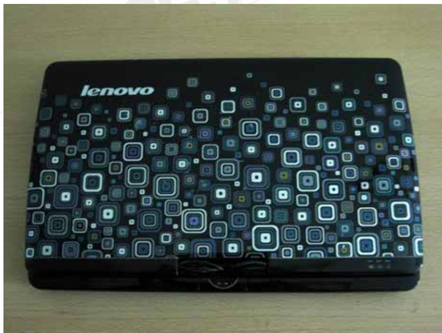
Fig.7 Front view of EUT