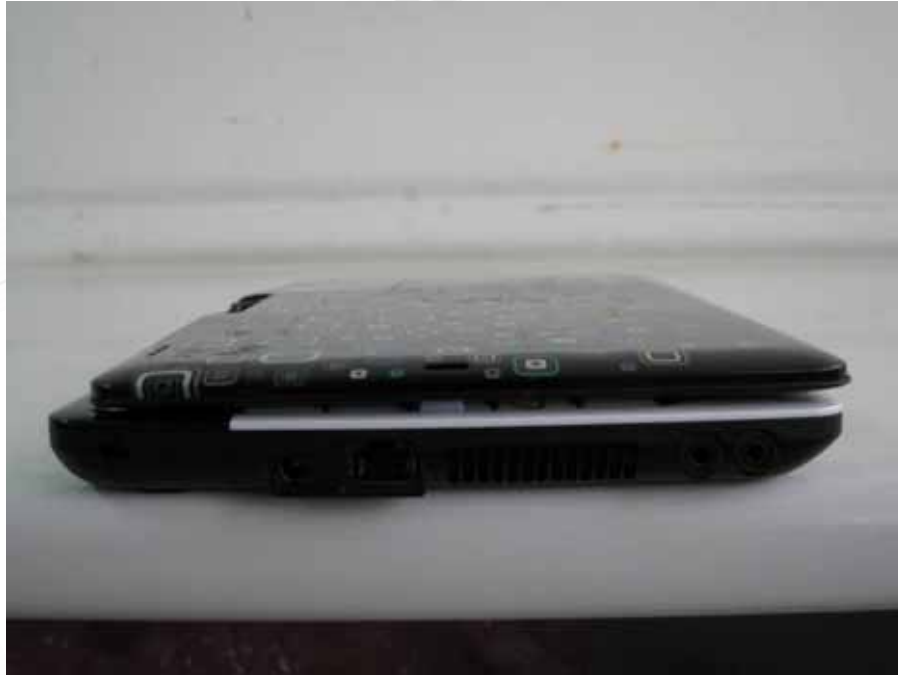
Fig.9 Left Side of EUT