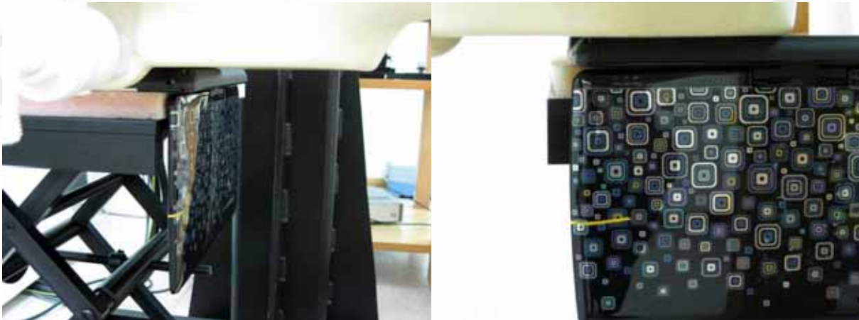
Fig.4 Lap-held mode

Unless otherwise stated the results shown in this test report refer only to the sample(s) tested and such sample(s) are retained for 90 days only. This test report cannot be reproduced, except in full, without prior written permission of the Company. 除非另有說明，此報告結果僅對測試之樣品負責，同時此樣品僅保留90天。本報告未經本公司書面許可，不可部份複製。 This document is issued by the Company subject to its General Conditions of Service ( www.sgs.com/terms_and_conditions.htm ) and Terms and Conditions for Electronic Documents ( www.sgs.com/terms_e-document.htm ). Attention is drawn to the limitations of liability, indemnification and jurisdictional issues established therein. Even if printed this electronic document is to be treated as an original within the meaning of UCP 600 article 20b. The authenticity of this document may be verified at www.sgsonsite.com/authentication . Any holder of this document is advised that information contained hereon reflects the Company's findings at the time of its intervention only and within the limits of client's instructions, if any. The Company's sole responsibility is to its Client and this document does not exonerate parties to a transaction from exercising all their rights and obligations under the transaction documents.