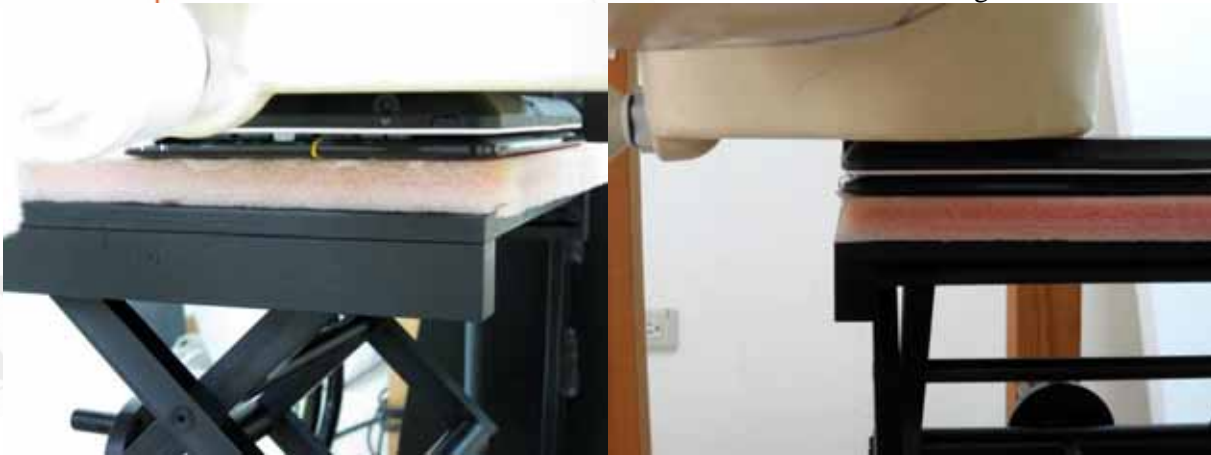
Fig.5 Tablet mode