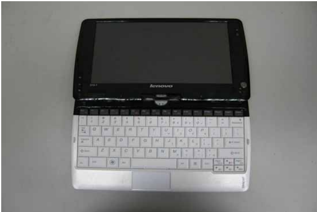
Antenn Location of EUT