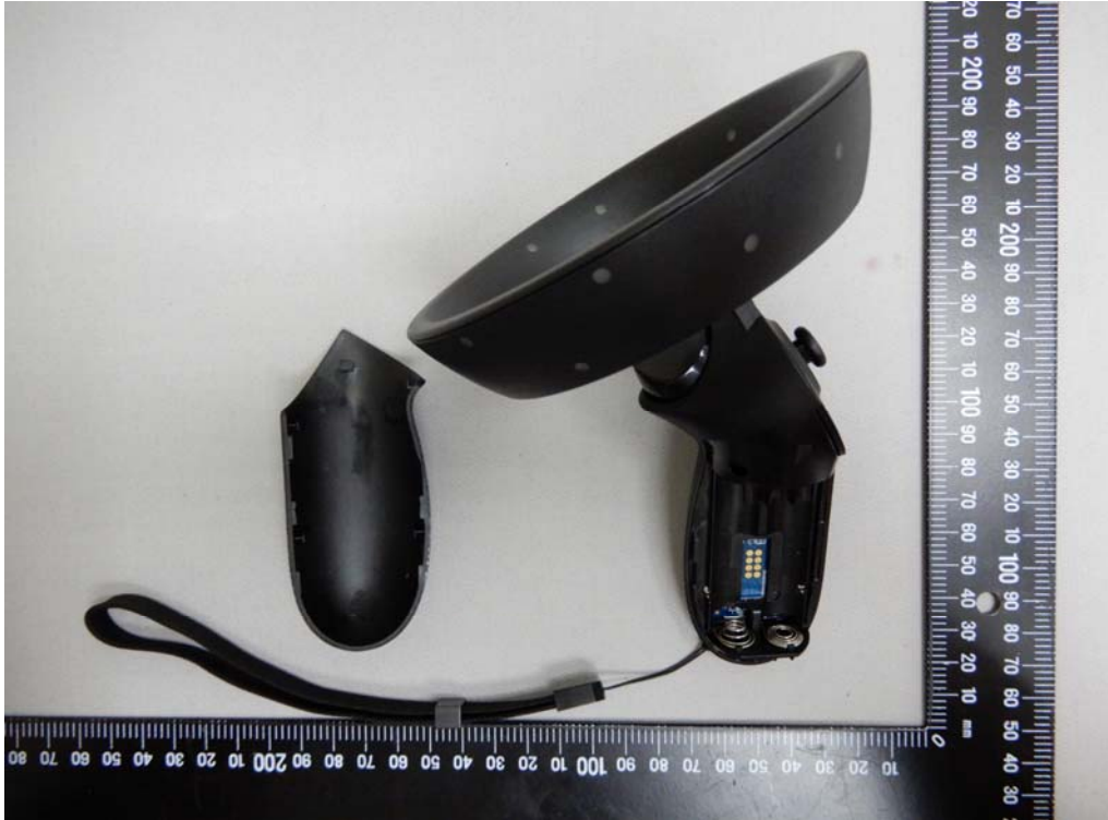
Open View of EUT – 2