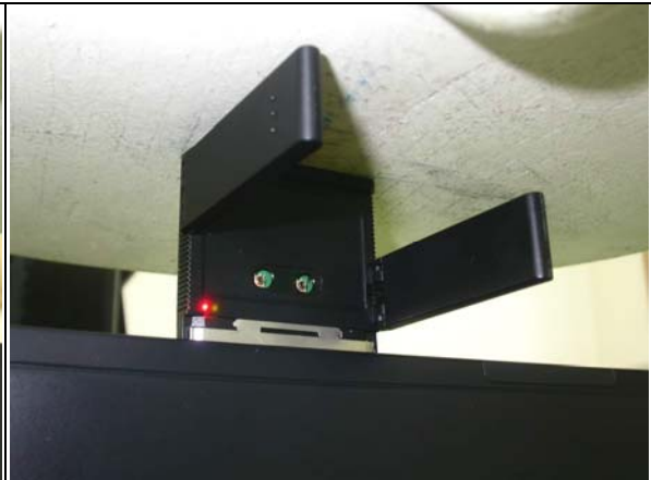
B2: NOTEBOOK MODEL: n6000