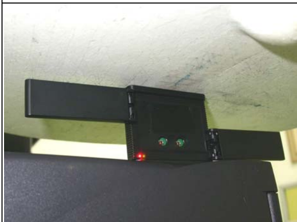
E2: NOTEBOOK MODEL: PP01L

NOTE: The tip of the EUT face to the phantom with 0mm-separation distance.