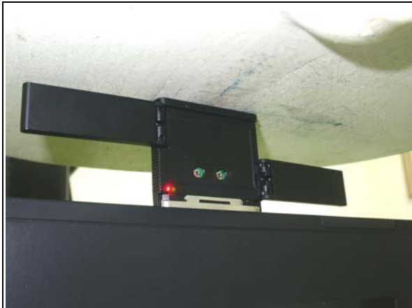
A2: NOTEBOOK MODEL: n6000