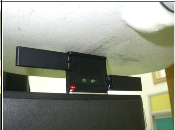
D2: NOTEBOOK MODEL: N800C