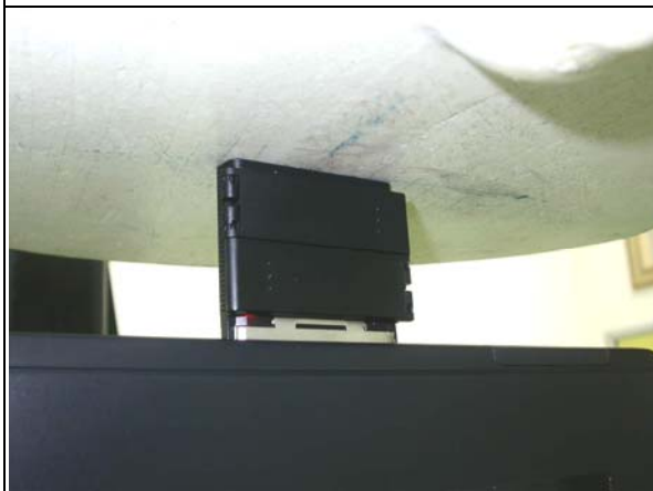
C2: NOTEBOOK MODEL: n6000