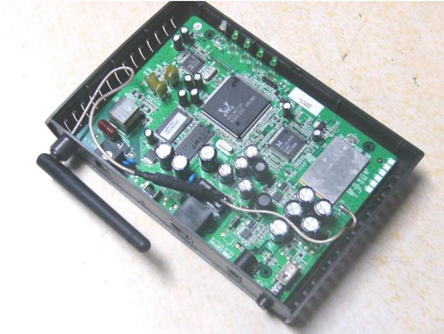
Main & RF board component side