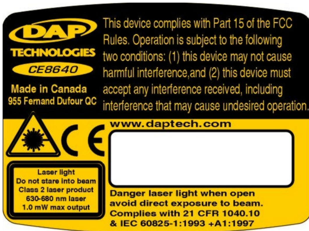
FCC Part 15 DoC Label