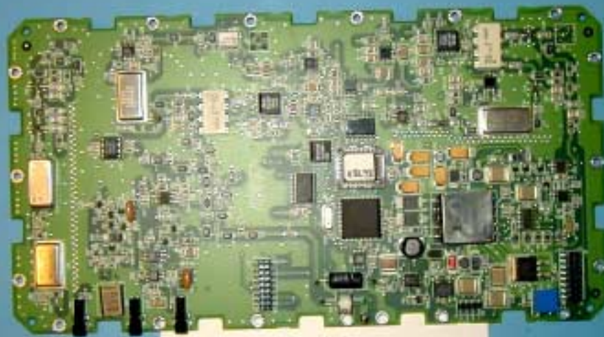
RF E. BOARD - (CP)