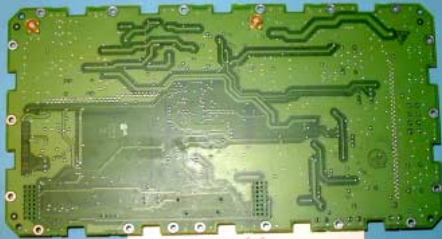
RF E. BOARD - (CP)