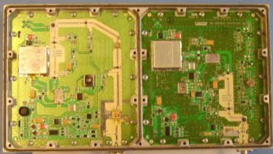
RF ASSY - TOP VIEW