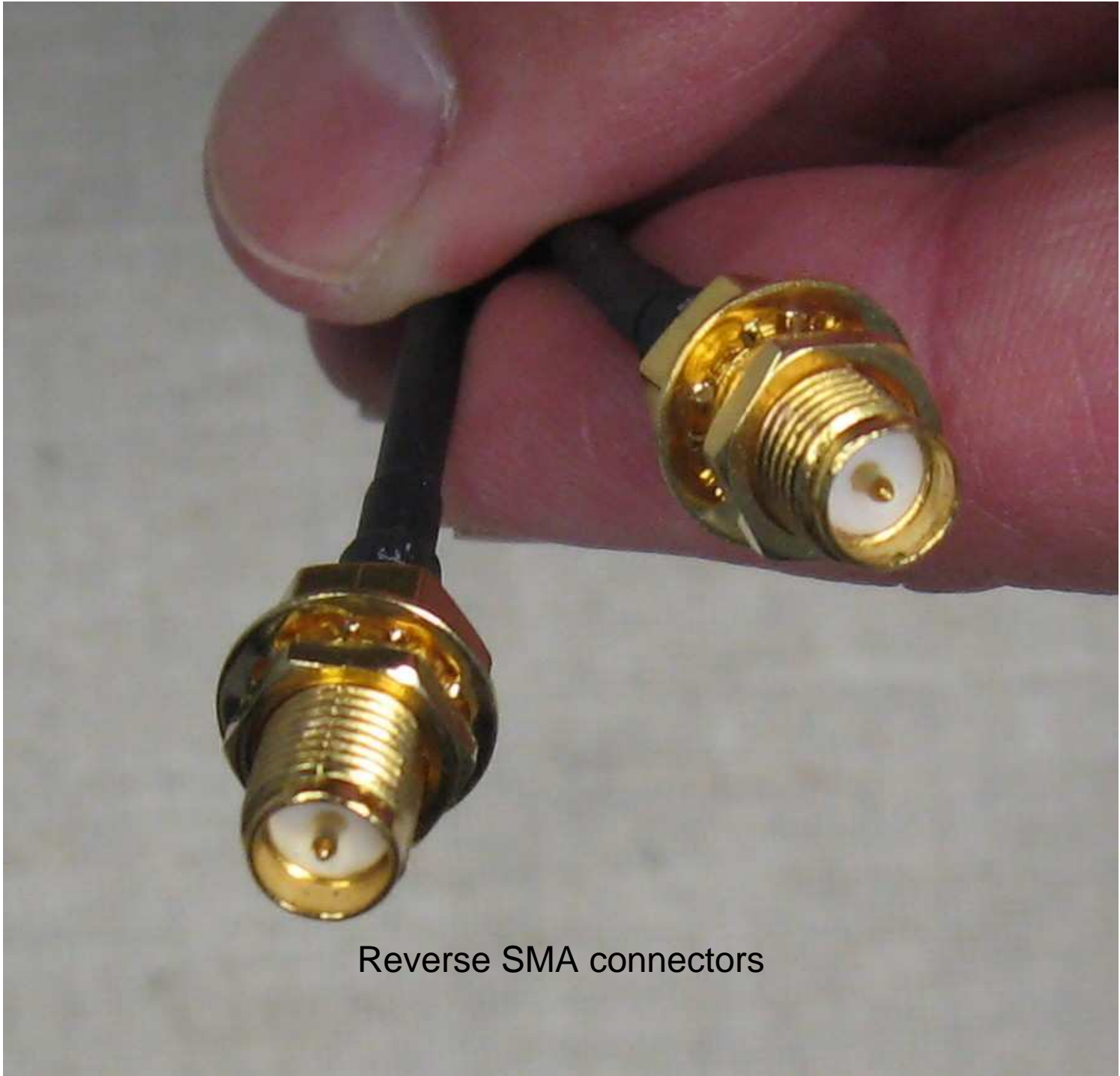
Reverse SMA connectors