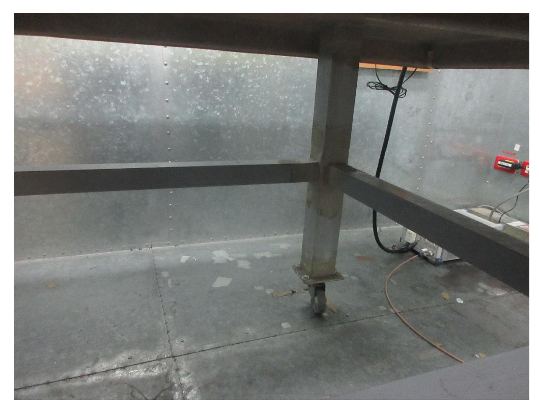
Under table view

Sporton International Inc. Page No. : C2 of C3