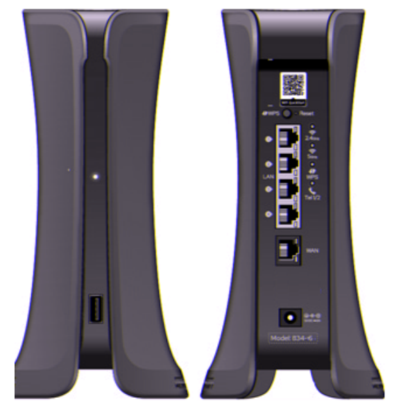
Figure 1. Front and Back of the 834-6 Gateway