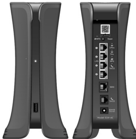
Figure 1. Front and Back of the 834-v6 Gateway

Figure 1 illustrates the front and back of the 834-v6 gateway.