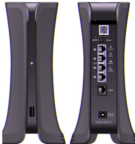
Figure 1. Front and Back of the 834-6 Gateway

Figure 1 illustrates the front and back of the 834-6 gateway.