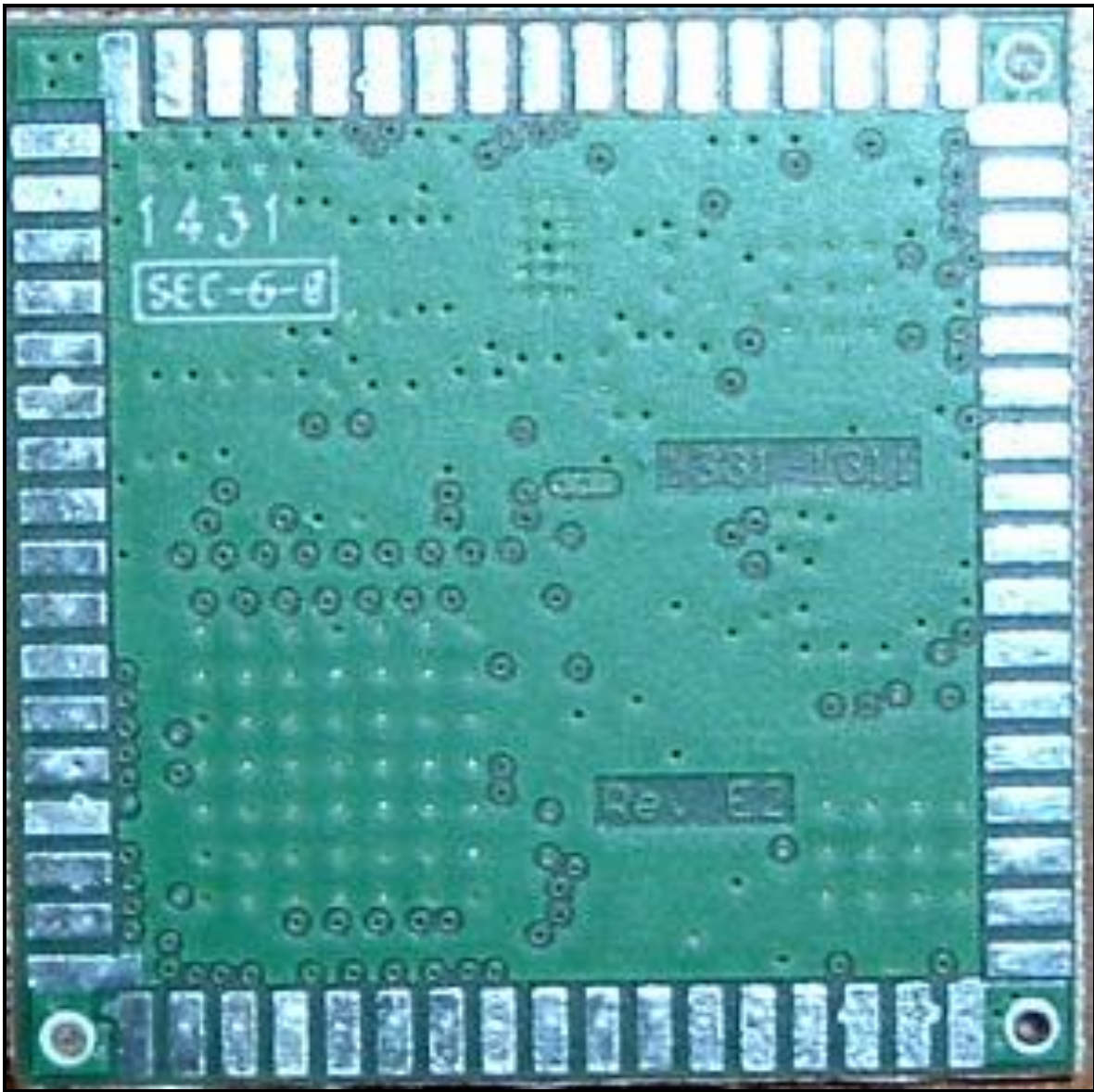
Photograph 13: EUT Bottom View