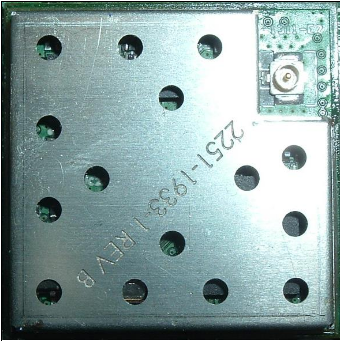
Photograph 11: EUT Top View with Shield