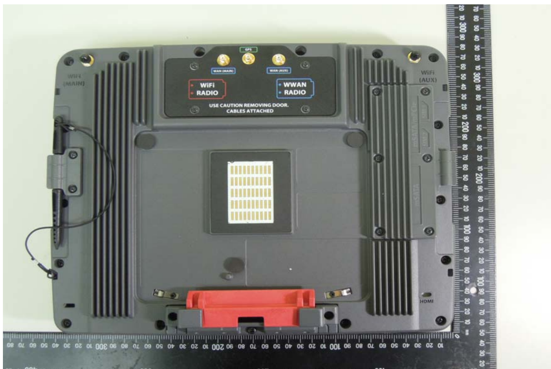
Back View of EUT - 2